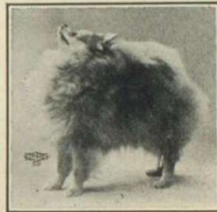
CH. CHISWICK GOLD STAR, IMP. (C.K.C.S.B. 62591) From an unretouched photo.

Bright orange. A beautiful dog of the well-known Dara strain, fully representative of that breeding, who carries a wonderful coat of the