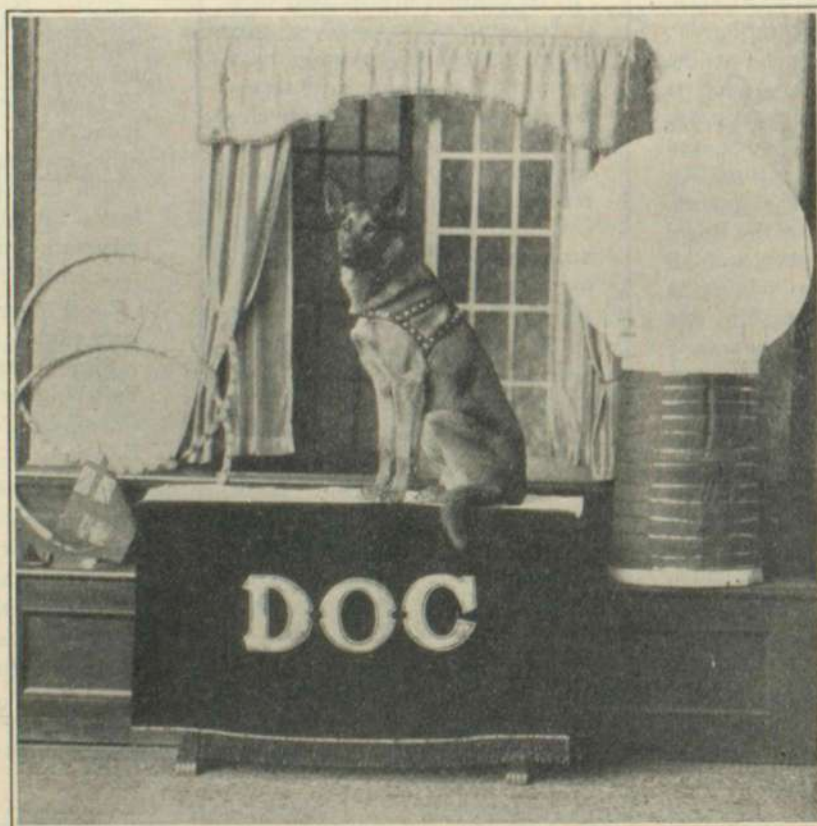
BLITZ VON DUSTERBROOK (C.K.C.S.B. 66963)

"Now he shares my board, and he owns my bed, And he fairly shouts when he hears my tread. Then if things go wrong, as they sometimes do, And the world is cold, and I'm feeling blue, He asserts his right to assuage my woes With a warm, red tongue and a nice, cold nose, And a silky head on my arm or knee, And a paw as soft as a paw can be. When we rove the woods for a league about He's as full of pranks as a school let out; For he romps and frisks like a three-months' colt, And he runs me down like a thunder-bolt. Oh, the blithest of sights in the world so fair Is my dog 'Doc' with his tail in air!"