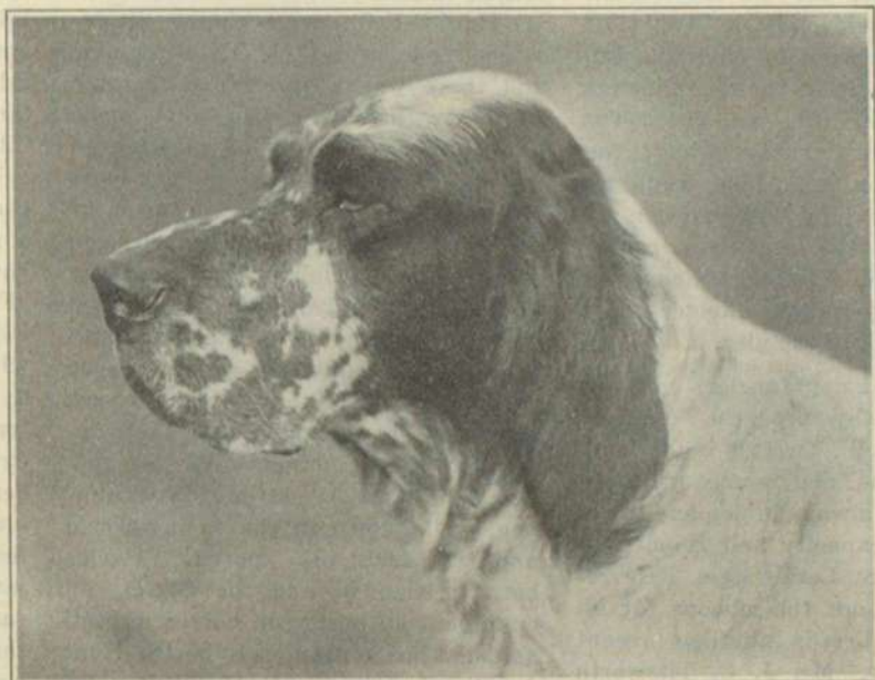
BORROWDALE SILENT KNIGHT

inmates could occupy too much space, tion is given of those illustrated:—