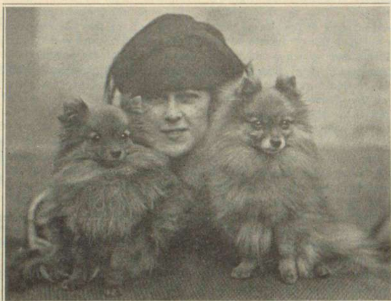
TYPICAL MINIATURE POMERANIANS

The only thing that stands in the way of the importation of Canadian Huskies into England is the quarantine which all foreign dogs have to undergo. But that would be a small affair of delay and expense if a few responsible men get together and, after acquiring some really representative Canadian sled dogs of the pure and typical breed, place the exported Huskies in the charge of some responsible or highly-placed person of the English kennel world. If a dozen or more representative Huskies were placed on the benches at the leading London and Provincial shows, an immediate demand for such dogs would ensue; for, after all, the Britisher may be depended on to quickly and loyally patronize dogs that come from the