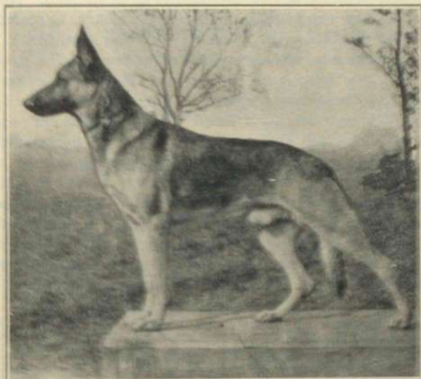
CHAMPION ALPHA VON KRONE

The known producing Shepherd A double cross of Alex. v. Westfalenheim, and son of Int. Ch. Cito von Ischeland, a producer of quality.