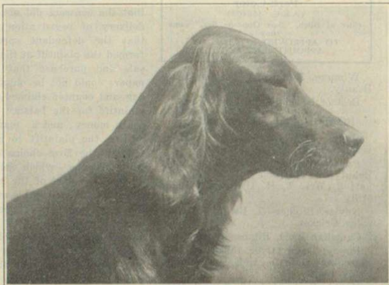
BENCH CHAMPION NORNA By Garmain Barney, ex Rheola Didona