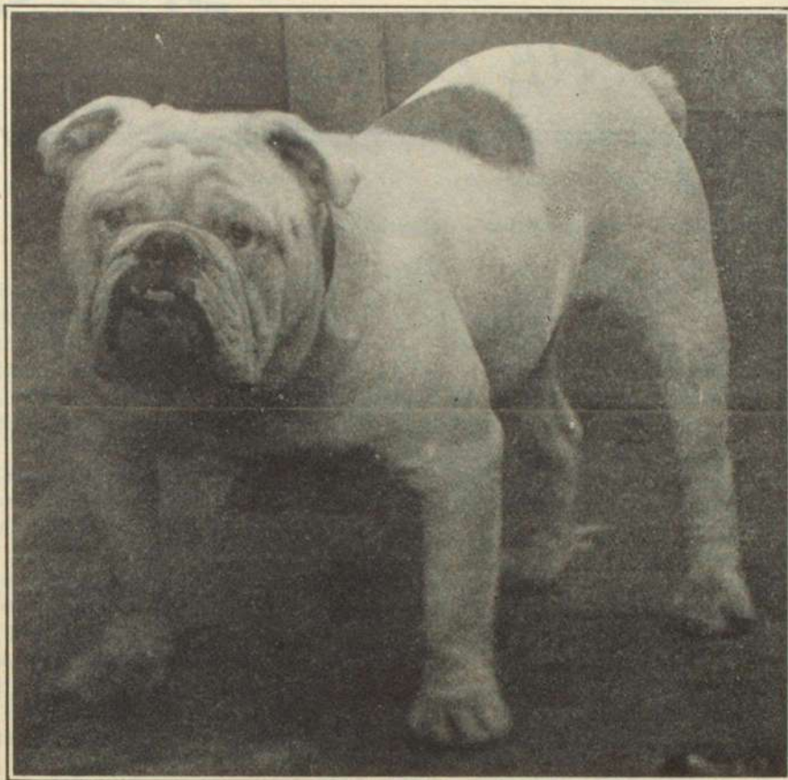
CHAMPION KIPPAX JOCK, IMP. (C.K.C. 71698) (A.K.C. 665170)