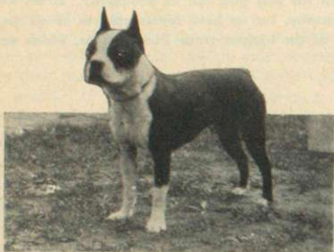
CHAMPION THE BURGLAR DEE CEE