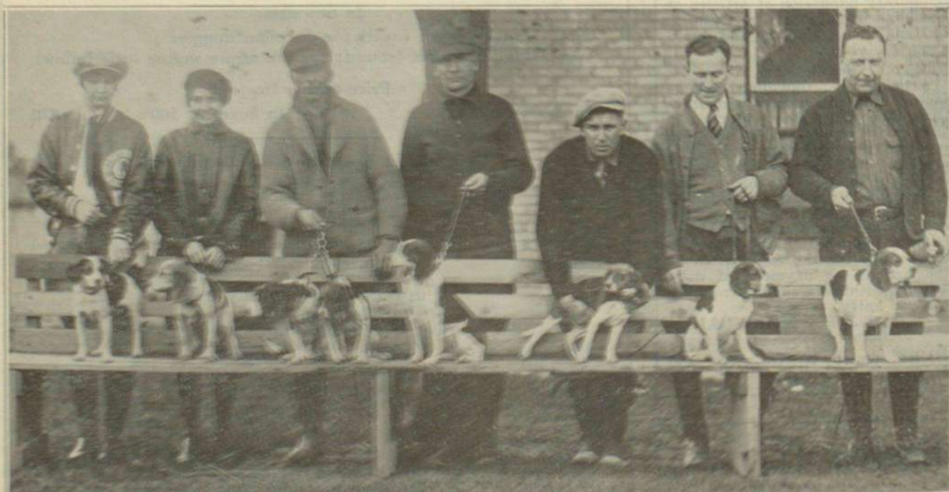
WITH THE BEAGLERS

Whiteheart Lady surmounted every obstacle winning best in the class not easily, but winning through the process of elimination, going into the second series she was rated only third high. Her first series should not be entirely overlooked although some credit must be given her brace mate Swingalong Bell who assisted her materially in keeping bunny moving.