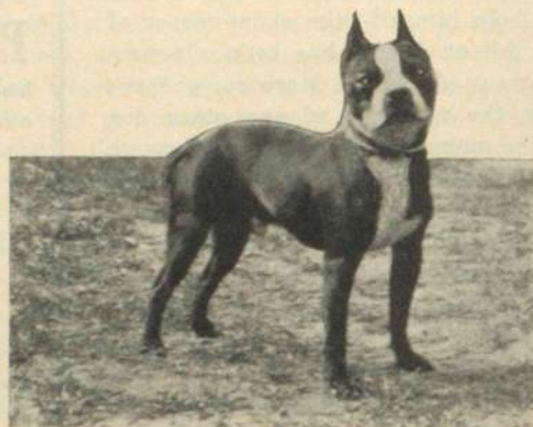
JUBILEE'S PRINCE CONDY