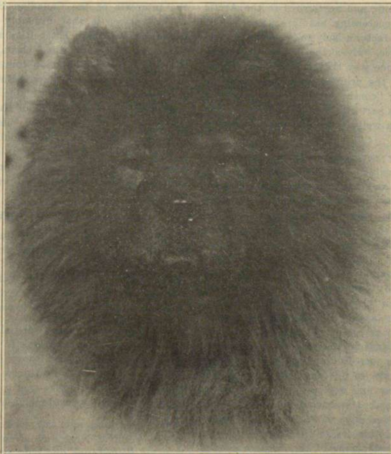
TYPICAL CHINESE CHOW CHOW DOG

A descendant of the last of a long line of