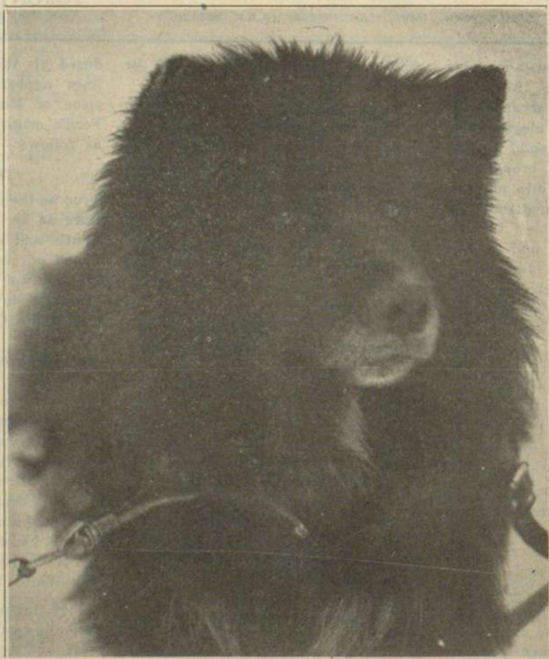
TYPICAL CANADIAN HUSKIE DOG

However, the theme of the descent of dogs may be more in the sphere of the scientist than it might be understandable among the ordinary, matter-of-fact, everyday dog man, who, very likely, will be not inclined to believe that