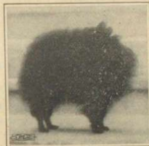
Tresleigh Zobey (Imp.)