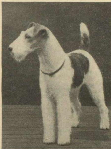
Vivadora's Latest Importation, CHAMPION CYPRIS.