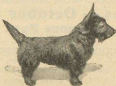
"Eglinton Sweet Memory,"—Canadian Champion.