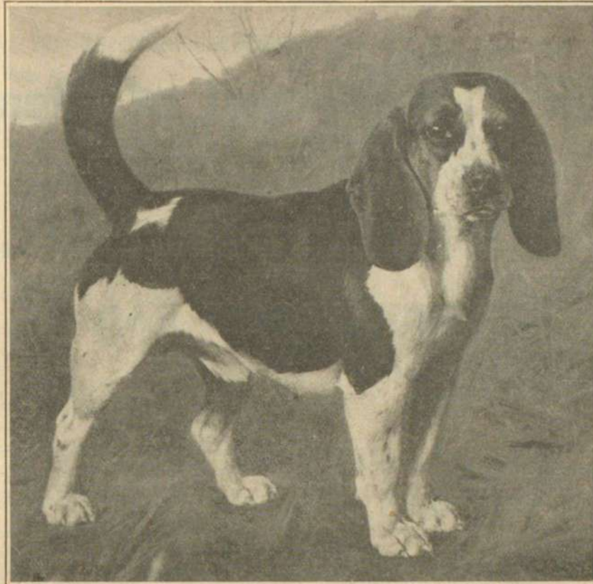
A RARE TYPE OF BEAGLE

If dogs must be bantamized let there be "bantam" classes; but the liliputians must not be designated "sporting" dogs. People who are fond of sporting dogs, are naturally jealous regarding what they consider to be the just-right sizes and portions of their sporting dogs. They do not complain because of the fads and fancies of the Toy Dog fancier who as often as not appears to revel in the monstrosities