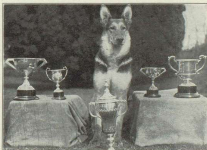
ERICH VOM ZUCHTGUT OF PICARDY P.H., H.G.H., Such.H., Sch.H., Z.Pr. With the cups won at his first show in England.