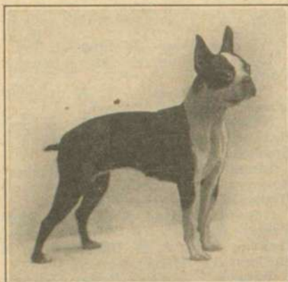
CHAMPION TI DEE MISS (C.K.C.S.B. 86511)