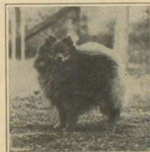
Ch. Chiswick Sunkist (Imp.)