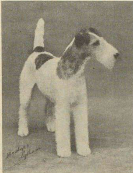
WALNUT RATTLER (Imp.)