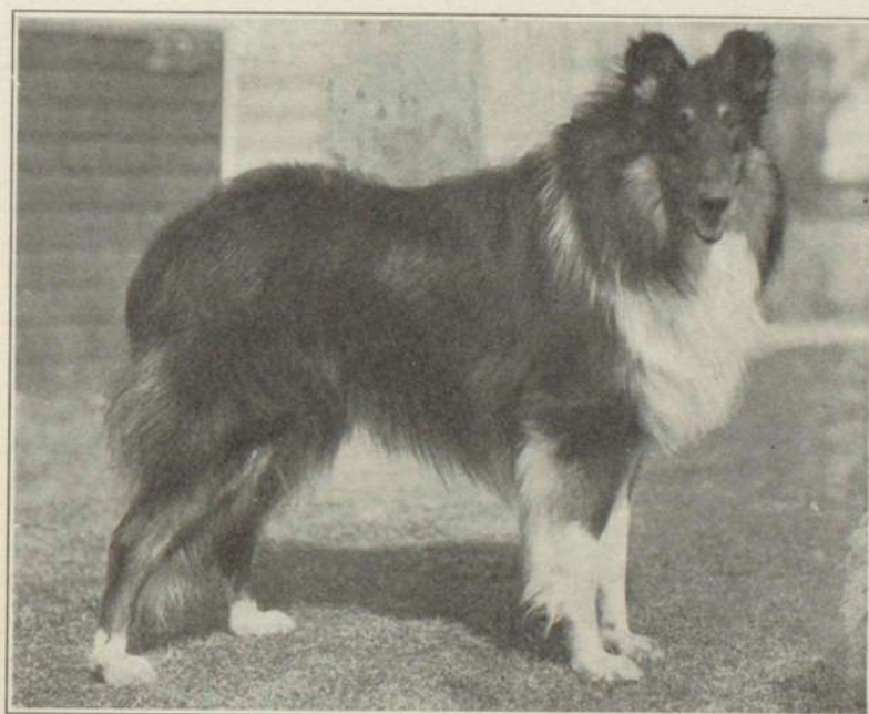
ELMHILL BLACK WATCH (C.K.C.S.B. 88031)