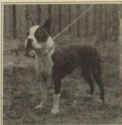
CH. THE BURGLAR DEE CEE and CH. STEVENS' CONDE BOY —The Real Producers—

At Hamilton Kennel Club show Ch. The Burglar Dee Cee was sire of about 25% of the entire entry.