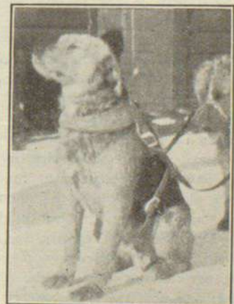
"Old Chum" as a well trained leader

But no more will his velvety brown ears rise in eager expectation at his master's approach, nor the soft brown eyes search the spaces for his coming. Mayhap, however, on the mystic trails that lie beyond the evening they may meet again for another glorious romp and enjoy again golden, care-free days in the haunts of the mystic white-tails. To a brave hunting dog and a true and faithful pal, Good Hunting!