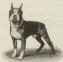
HORNING'S HONEY BOY

In offering this sensational dog at Stud we are giving the Fanciers opportunity to breed to one of the best and a winner wherever shown. For Stud fees and particulars write to