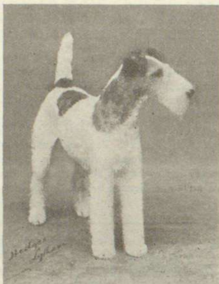
WALNUT RATTLER (Imp.)