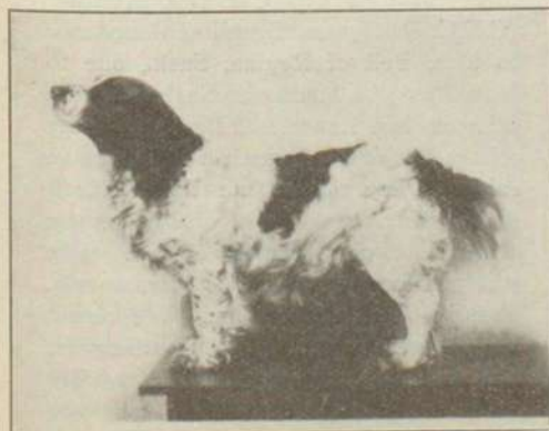
"Ch. Monk of Burnside"