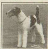
AT STUD Wire Fox Terrier