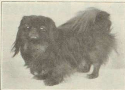
CH. BUMBLE OF RIVERCOURT (C.K.C. 64200)—(A.K.C. 779943).

Peke breeders know, and realize, that this smart little red son of Wool-a-Pug of Badminton (son of Roddy of Hartlebury, Imp.), ex Kwa-Wha of Badminton (daughter of Roddy of Hartlebury, Imp.), is bred to produce quality stock—and he does. They know, too, that for the last three years, Ch. Bumble of Rivercourt has been at or near the top of the hottest possible competition at all the shows under all the judges—a sure test of sterling quality.