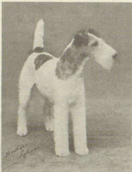
WALNUT RATTLER (Imp.)