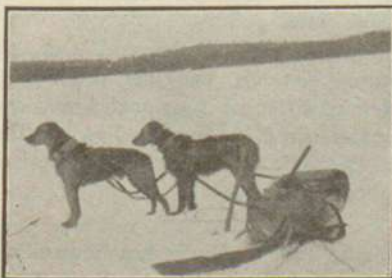
"Old Chum" (leading) on the trap line in the days of his youth