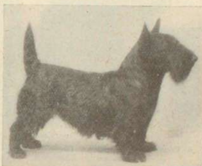
"A Haldon Scottie"

Young Studs, Matrons and Puppies usually for sale.