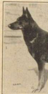
KATJA V The world's

The show re on the almost won five Grand countries, toget in the United a total of sever different counti in Show on indeed she cap less than three ing 1930.