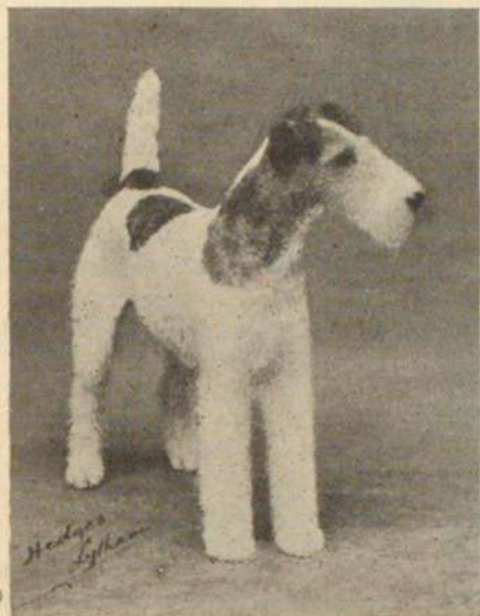
WALNUT RATTLER (Imp.)

Walnut Rattler is a double cross of Ch. Fountain Crusader. He is a winner and a producer, and no dog can be better than that from a breeders point of view. Fee $20.00