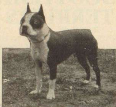
Ch. The Burglar Dee Cee

A Consistent Winner—A Great Producer Also the Coming Champion