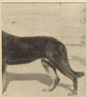
VON BLAISENBERG The greatest Shepherd Dog

record of "Katja" borders on the impossible. She has won Championships in four States, and in Canada—seven championships, in five countries. She has been Best on very many occasions; captured this distinction no less than five times in one week dur-