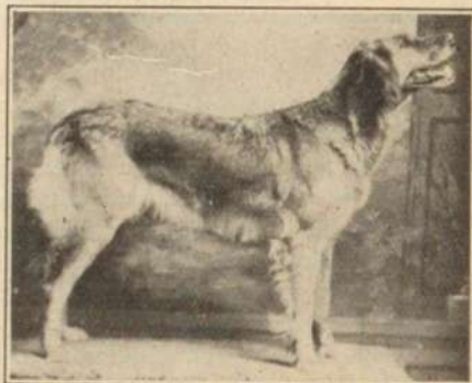
The Golden Retriever CH. DAME DAPHNE