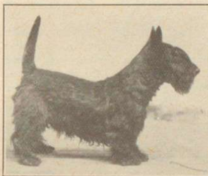
Ch. Greyhope Grit

Ch. Greyhope Grit represents a choice combination of the world famous Barrack and Romany strains.