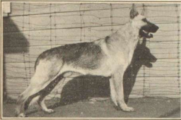
CH. ARMOR VON VOGEL

O WING to a change in bloodline we will sell Champion Armor Von Vogel, one of the greatest Shepherd Sires in Canada. Armor is sired by the one and only Erick Von Grefenwerth, Armor's Dam by Double Sieger Cito Bergerslust. Armor is the Sire of The Winners Bitch and Reserve Winners Bitch, Fort Garry Show 1929; also Sired Reserve Winners Dog to Armor at same show in 1931 in show put on by same Club. He is the sire of 1st Novice Dog, 1st Puppy Winners bitch and Best Puppy in show, All Breeds.