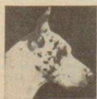
BOHRER GREAT DANE KENNELS P.O. Box 220, Allentown, Pa., U.S.A. Great Dane pup- pies, show and breeding stock for sale.

"That the license be granted for the breeds enumerated only."