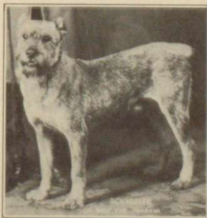
CH. ROLF VON THORENA