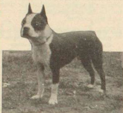
Ch. The Burglar Dee Cee

A Consistent Winner—A Great Producer Also the Coming Champion