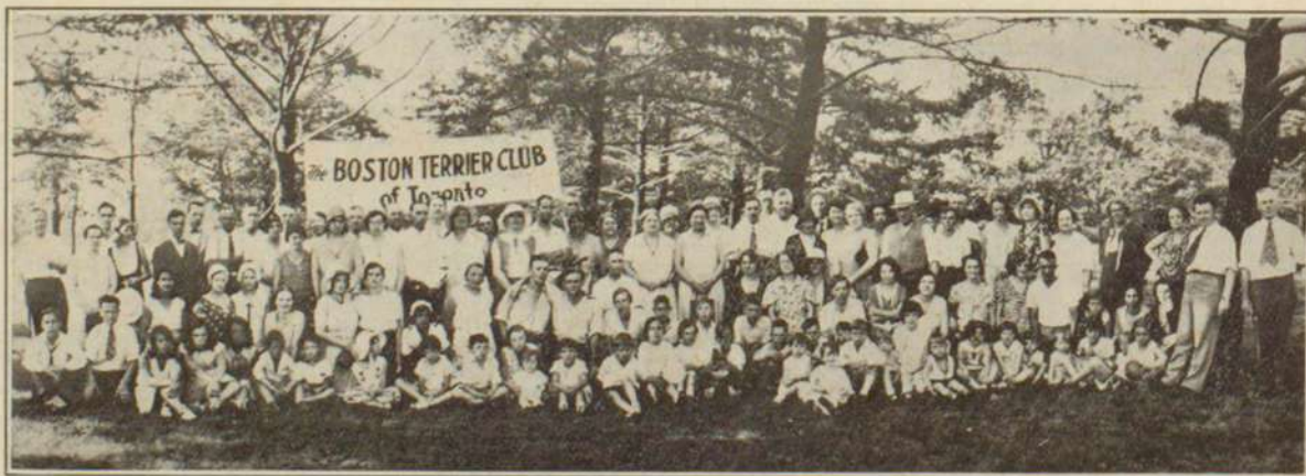
Beautiful High Park is "home sweet home" to many happy Toronto folks every summer, but no happier group than those depicted above in our illustration, the officers and members of the Boston Terrier Club, of Toronto, ever partook of the pleasure. "The Mysterious Mister Boston Terrier" is one of the happy group. We wonder how many will recognize him here.