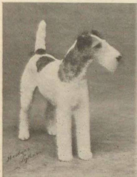
WALNUT RATTLER (Imp.)

Walnut Rattler is a double cross of Ch. Fountain Crusader. He is a winner and a producer, and no dog can be better than that from a breeders point of view. Fee $20.00