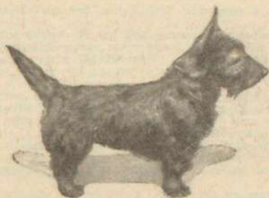
"Eglinton Sweet Memory,"—Canadian Champion.