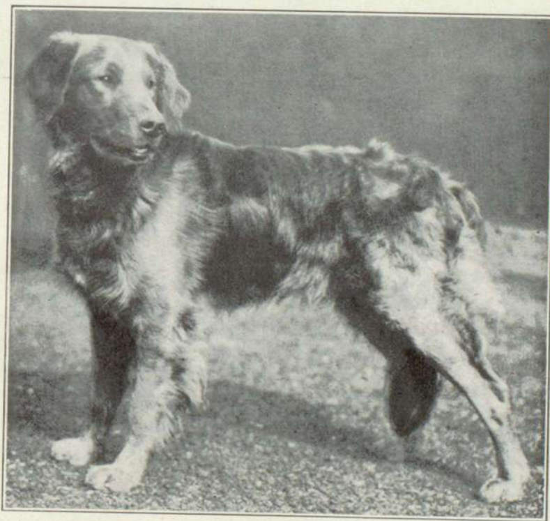
THE GOLDEN RETRIEVER CHAMPION SPEEDWELL PLUTO (Imp.) (C.K.C.S.B. 92496)