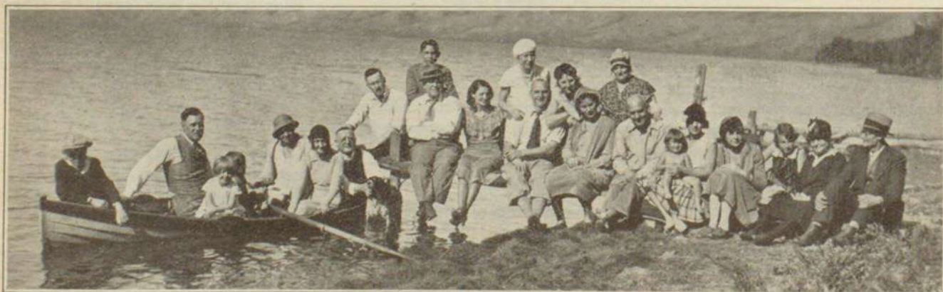
A happy group of Regina fanciers "out for the day" at Sandy Beach.