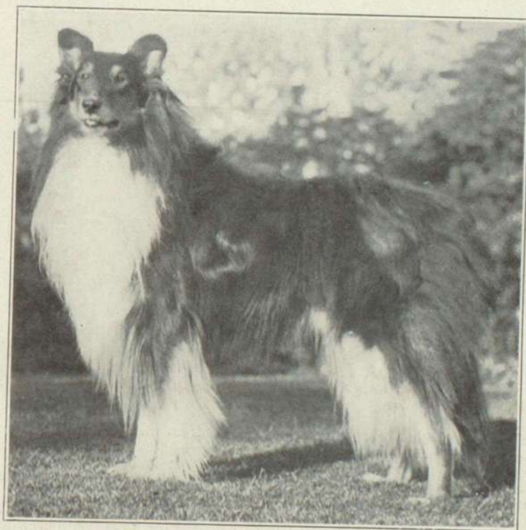
CHAMPION BLACK PRINCE II