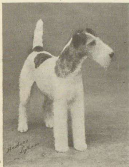
WALNUT RATTLER (Imp.)

Walnut Rattler is a double cross of Ch. Fountain Crusader. He is a winner and a producer, and no dog can be better than that from a breeders point of view. Fee $20.00