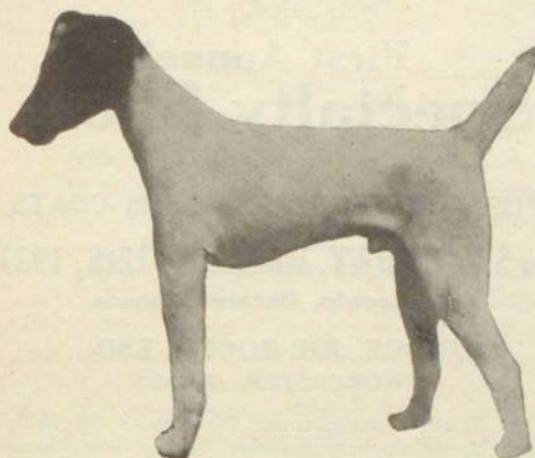
CHAMPION GARWOOD MAJOR