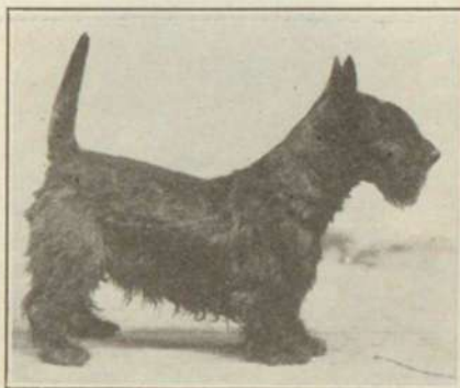
Ch. Greyhope Grit

Ch. Greyhope Grit represents a choice combination of the world famous Barrack and Romany strains.