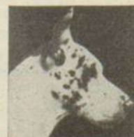
BOHRER GREAT DANE KENNELS P.O. Box 220, Allentown, Pa., U.S.A. Great Dane puppies, show and breeding stock for sale.