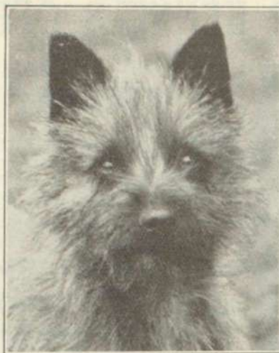
Bunty of Cairndania

If we could see the treatment of the King's Cairn in the royal homestead, it is a certainty we should find his life and living planned on sound, practical