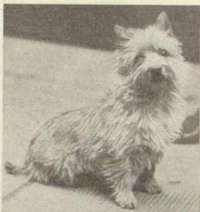
Who Wouldn't Own a Cairn?