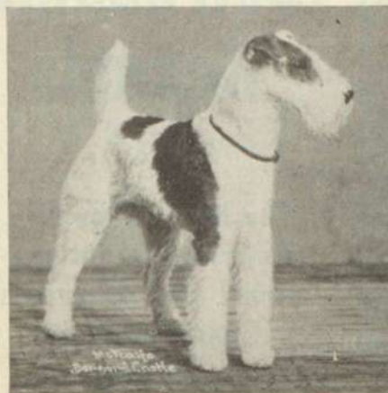
Champion Stormy Boy (Imp.)