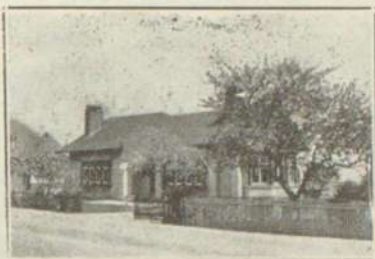
Home of the Vivadoras