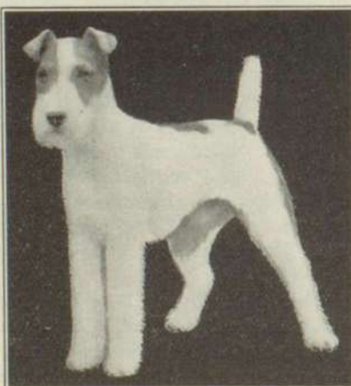
Colgrain Comrade (Imp.) (C.K.C.S.B. 94214)