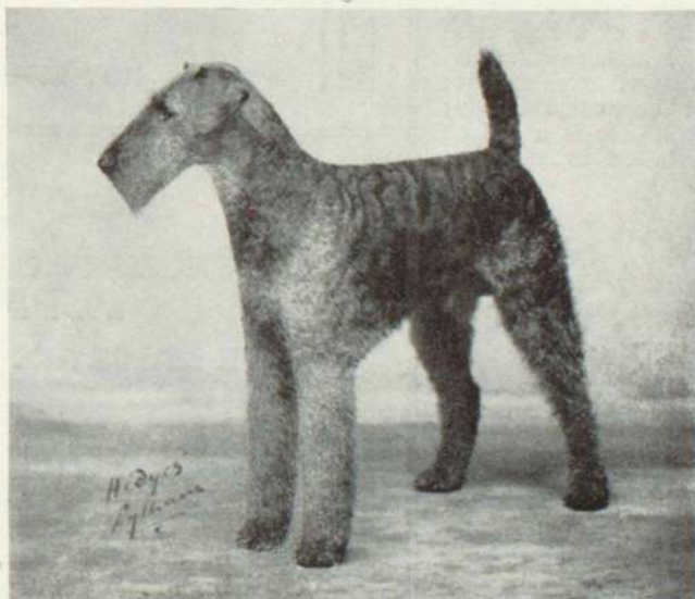
The English Winning Airedale STOCKFIELD JUPITER