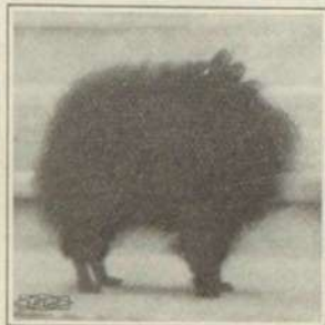
Tresleigh Zobey Imp.