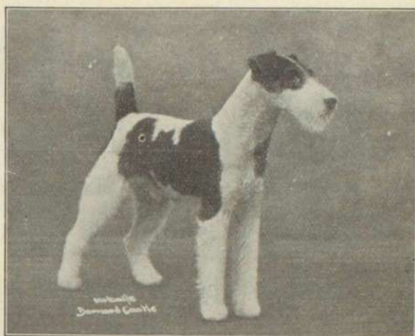
THET TIMBERSON (IMP.)