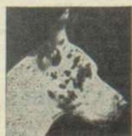
BOHRER GREAT DANE KENNELS P.O. Box 220, Allentown, Pa., U.S.A.

May be purchased at Kennel and Bench Office, 25 Melinda St., Toronto. Price, $2.00.