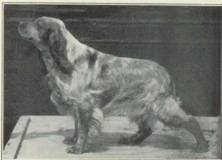
CHAMPION OTTAWA SAMSON