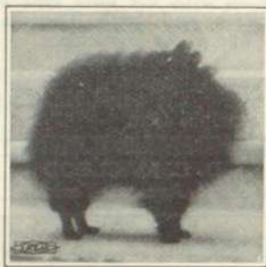
Tresleigh Zobey Imp.

The most noted and outstanding Kennel of the breed. Our achievements on the show bench prove it. Our Selected Stock is from the very best British lineage. The Stud Force is comprised of many of the very best specimens procurable. Our Breeding Bitches have all been carefully selected.