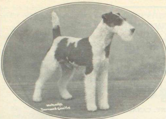
Thet Timberson (Imp.) AT STUD — FEE, $20.00.

TIMBERSON has been immediately singled out by all who have visited the Kennels as the ideal stud dog; beautiful conformation, tremendous long, clean head, chuck full of quality, fire and go. THERE is no better terrier before the fancy today the equal of Timberson in all he has to transmit in pedigree, type, stamina, substance and soundness.