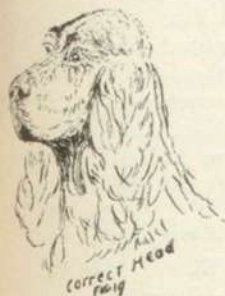
Correct Head FIG. 19