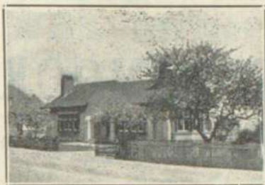
Home of the Vivadoras