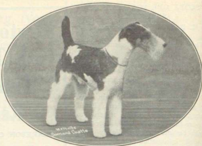
Int. Ch. Thet Timber Sire of Thet Timberson

(Shipping address, Kennels, 20 Chamberlain Ave.)