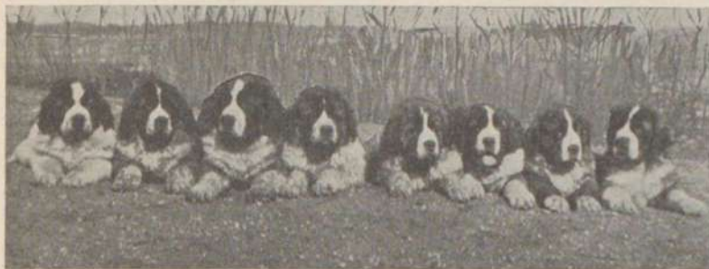
"Like peas in a pod." A recent litter by "Hercuveen King."