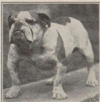
CHAMPION MARWELL MARQUIS (A.K.C.S.B. 848370). (C.K.C.S.B. 88532).

represents the outstanding Bulldog of 1931. At four shows under four different judges he won his championship crown without knowing the taste of defeat; not only that, but he has been placed Best of Breed on three occasions—the sure test of quality. He is wonderful in all head properties, massive bone, low to ground. Pear shaped body, and sires large litters of strong even puppies. He is a 52 lb. dog.