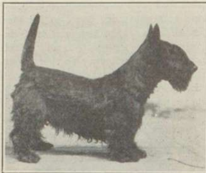
Champion Greyhope Grit

represents a choice combination of the world famous Barrack and Romany strains. He is a real Scottie in every sense of that term—a dog of the highest quality; strong and vigorous.