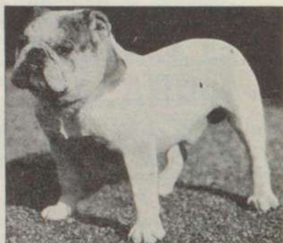
CH. CREWE SO FAVORITE (A.K.C.S.B. 848369). (C.K.C.S.B. 78534).

is a 50 lb. dog that has won splendidly in England, the land of his birth, and in Canada, the land of his adoption.