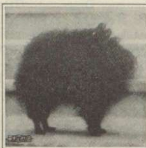
Tresleigh Zobey Imp.

The most noted and outstanding Kennel of the breed. Our achievements on the show bench prove it. Our Selected Stock is from the very best British lineage. The Stud Force is comprised of many of the very best specimens procurable. Our Breeding Bitches have all been carefully selected.