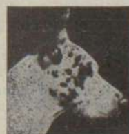
BOHRER GREAT DANE KENNELS P.O. Box 228, Allentown, Pa., U.S.A. Great Dane puppies, show and breeding stock for sale.