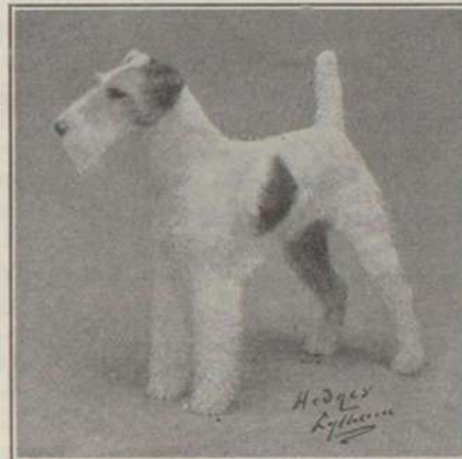
TALAVERA TANTALUS (Imp.)