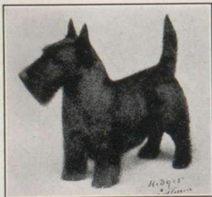
Ch. Walnut Rouge (Imp.)