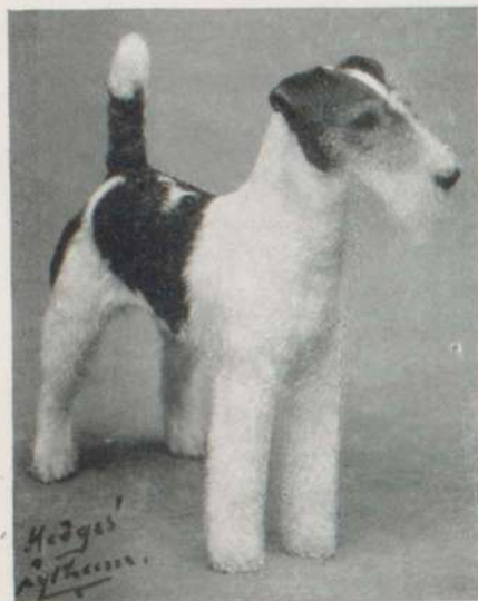
Wyrecote Watalad (Imp.)