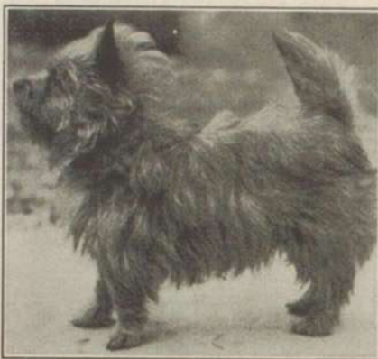
TINKER OF TAPSCOT