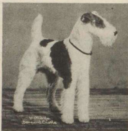
CH. STORMY BOY