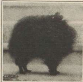
The Late Tresleigh Zobey (Imp.)