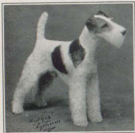
Wyrecote Commander (Imp.)