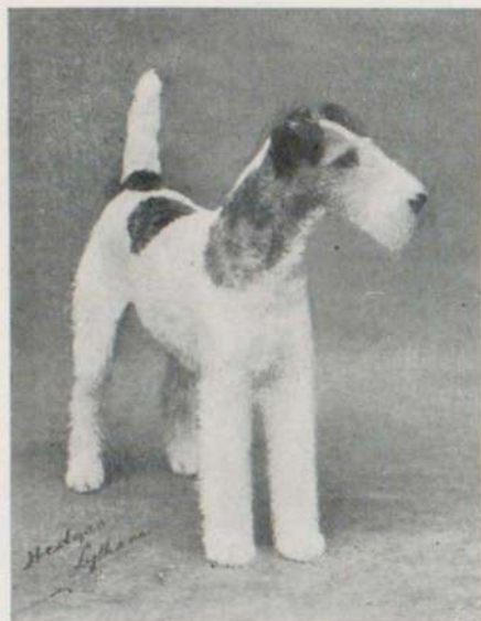
Ch. Walnut Rattler (Imp.)

Wire-Haired Fox Terriers and Scottish Terriers. Dogs which have been most consistent winners in the show ring. Dogs which have proven their worth in the stud kennel.