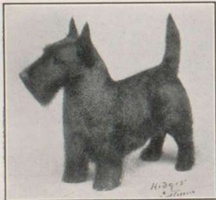
Ch. Walnut Rouge (Imp.)