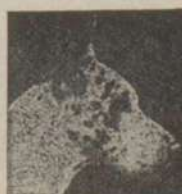
BOHRER GREAT DANE KENNELS