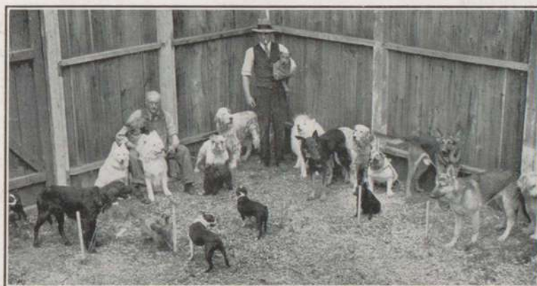
A typical string of show dogs. Twenty dogs campaigned at the spring shows by professional handler