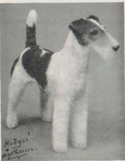
Wyrecote Watalad (Imp.)

Wire Haired Fox Terrier puppies, and Scottish Terrier puppies from choicely bred and carefully selected matings, and a few nice Scottie females, due soon in season. Reasonable.