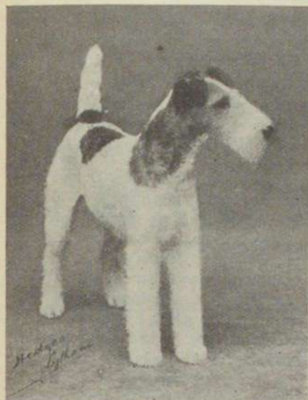
Champion Walnut Rattler (Imp.)