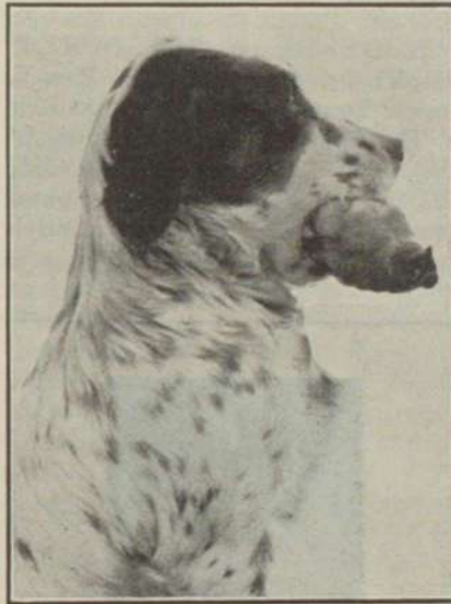
HIS FIRST HAPPY MOMENT. As steady as a rock, not a feather ruffled, and only six months old.