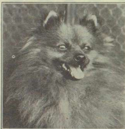
CH. MELBOURNE SUPREME