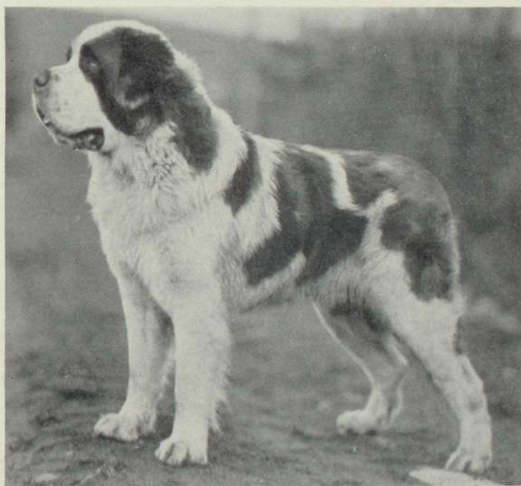
INT. CH. RASKO V.D. REPPICH-WALDECK, One of the world's greatest living St. Bernards