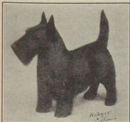
Champion Walnut Rouge (Imp.)

Home of imported Wire Fox Terriers and Scottish Terriers— selected from England's most noted kennels.