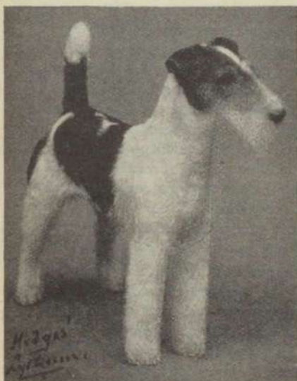
Champion Wyrecote Watalad (Imp.)