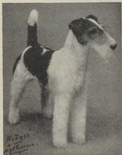
Champion Wyrecote Watalad (Imp.)

BRAEMORE KENNELS have been distinguished by the high quality of the Wire Fox Terriers and Scottish Terriers, which have come from the foremost kennels of Great Britain.