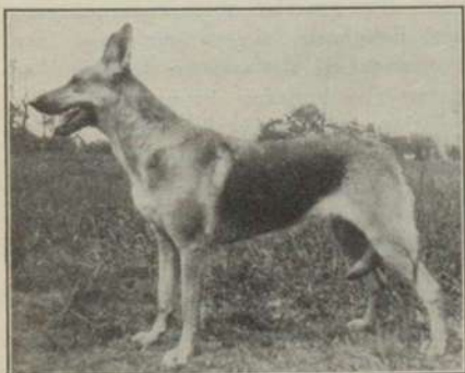
Ch. Princess Ima of Dundas