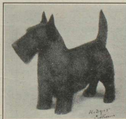
Champion Walnut Rouge (Imp.)

Selected "Wires and Scotties" for Sale. Studs — Brood Matrons — Puppies Show Dogs — Guards — Companions. Braemore Prices are Always Reasonable. Phone Midway 9811