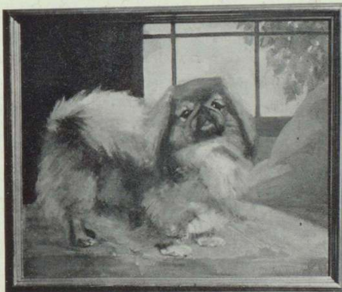
INT. CH. WHITWORTH MICHAEL