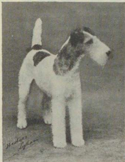
Champion Walnut Rattler (Imp.)