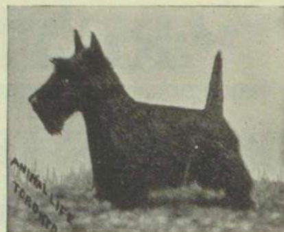
CH. HALDON BANJO