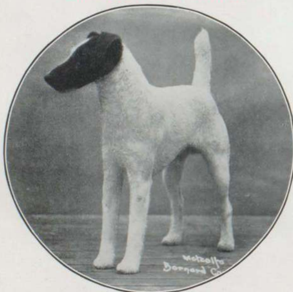
CHAMPION STALL SUPERB

This smart Fox Terrier is really a splendidly bred youngster, and we offer him to breeders with confidence. His sire is CH. CHOSEN DON OF NOTTS, and his dam, LEAF END, has for sire and dam a son and daughter of Ch. Selecta Ideal.