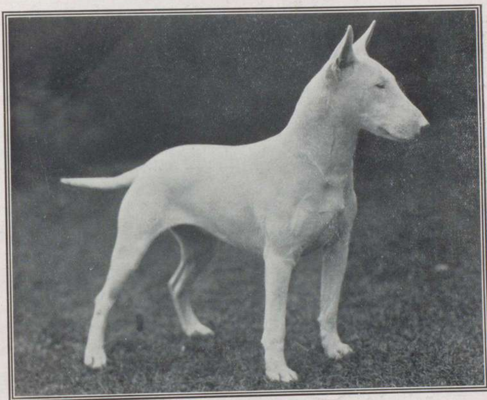
CHAMPION COOLYN QUICKSILVER

(Photo taken when Coolyn Quicksilver was nine months of age)