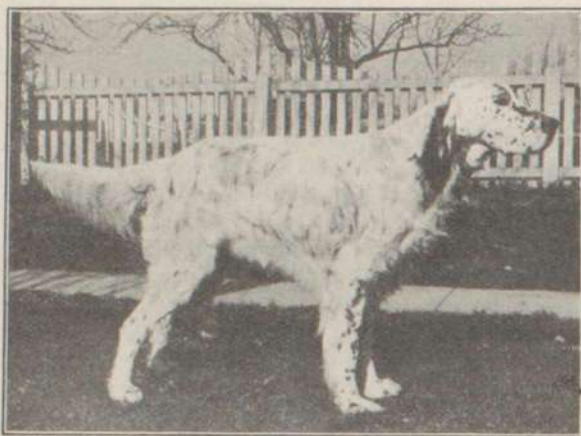
CH. ESTERADA BLUE HAZEL

AT STUD - FEE $50.00 Also Two Outstanding Sons of His AT STUD DUKE OF HURON - FEE $25.00 PRINCE OF HURON - FEE $35.00