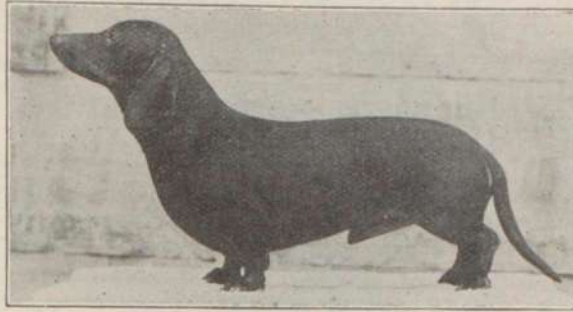
Int. Ch. Arno von Luitpoldsheim