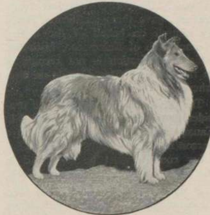
SIR BOB OF CLUNY

On Thursday, January 30th, Toronto Humane Society's Hall was the meeting place of many animal lovers who had come together to take part in the decorating of the Collie, "Sir Bob of Cluny" (103587), by the Toronto Humane Society. "Sir Bob," who is a son of "Ch. Captain Lukeo," out of a "Ch. Eden Emerald bitch" earned the attention of the Society because of two outstanding items of life saving. Toronto newspapers made it appear that "Sir Bob" had saved the lives of two different individuals, but our recollection leads us to believe that the dog helped to save the same man's life on two different occasions and the particulars are as follows: