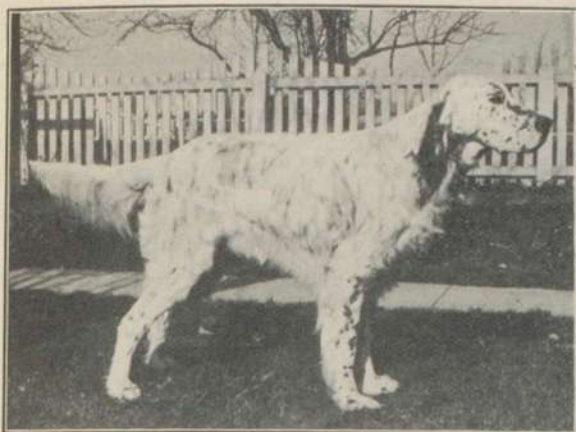
One of the most outstanding English Setters in America today CHAMPION ESTERADA BLUE HAZE C.K.C. 117805 STUD FEE, $50.00 A.K.C. 888421 Also two outstanding sons of his at Stud DUKE OF HURON—Fee $25.00. PRINCE OF HURON—Fee $35.00.