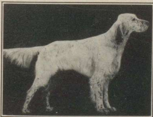
MIKE OF BRIMORE (C.K.C.S.B. 120608)

HOME OF THE VERY BEST IN ENGLISH SETTERS