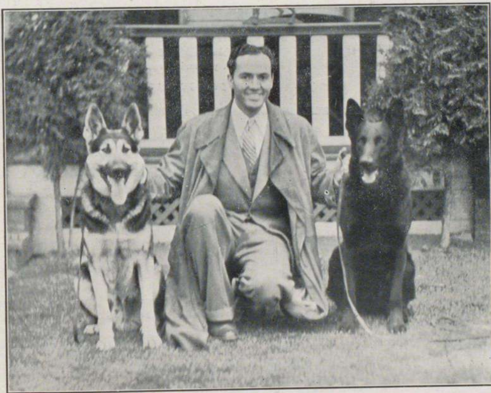
A Happy-Go-Lucky Trio

The engaging "BUDDY" ROGERS with Alpha v. Bergholtz (black) and his son Graf v. Stephanitz.