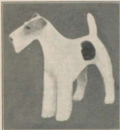
Westdale Brokers Tip

Puppies by both above Stud forces for sale at reasonable prices. Correspondence to: