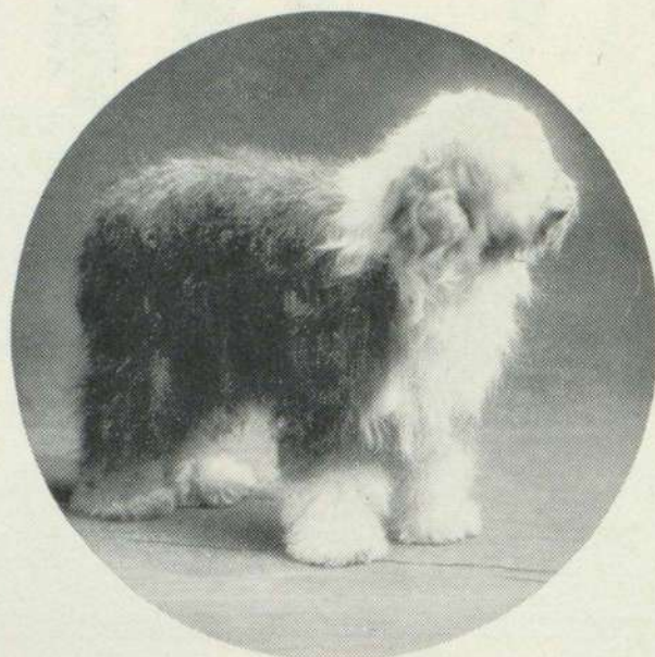
Ch. Mistress Fay of Pastorage

PLAN TO EXHIBIT AT THE 48th ANNUAL ALL-BREED