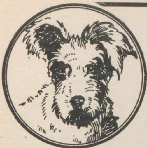
The best is none too good for me.