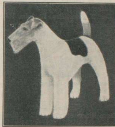
Vivadora Surething (Imp.)

Ch. Beau Brummel of Wildoaks Thet Trio (Imp.) Simons Dimple Westdale Brandysnap Ch. Benson Dark Horse Westdale Varsity Girl Wire Maids Double