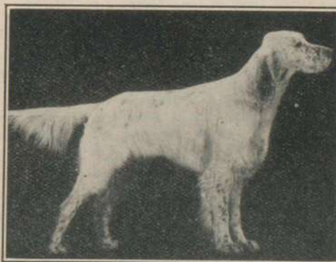
MIKE OF BRIMORE (C.K.C.S.B. 120608)

HOME OF THE VERY BEST IN ENGLISH SETTERS