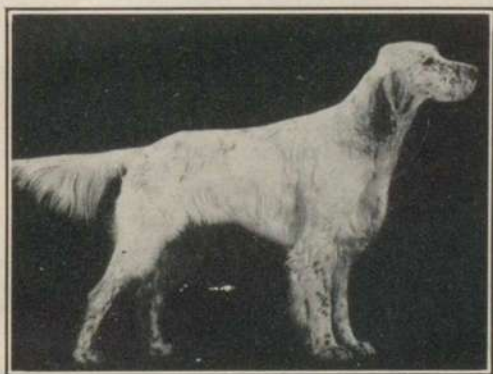
"MIKE OF BRIMORE" AT STUD

To the building of this establishment much thought and unlimited expense was devoted, including the patronage of the greatest English Setters of the day, viz.: Int. Ch. Pilot of Crombie of Happy Valley, Marvel of Crombie and others of similar calibre. The results of these breedings have proved most gratifying to us. Anyone wishing to own something outstanding in this breed may with confidence write us for particulars.