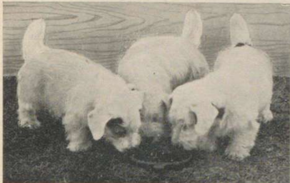
'SEALYHAM' PUPPIES'