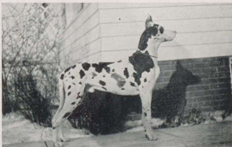
HARLEQUIN GREAT DANE INT. CHAMPION HEROLD V. LUDWIGSKANAL