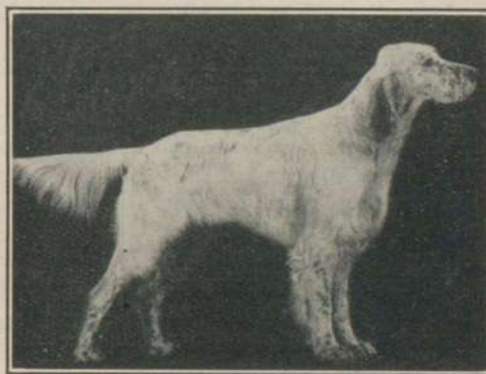
"MIKE OF BRIMORE" AT STUD

To the building of this establishment much thought and unlimited expense was devoted, including the patronage of the greatest English Setters of the day, viz.: Int. Ch. Pilot of Crombie of Happy Valley, Marvel of Crombie and others of similar calibre. The results of these breedings have proved most gratifying to us. Anyone wishing to own something outstanding in this breed may with confidence write us for particulars.