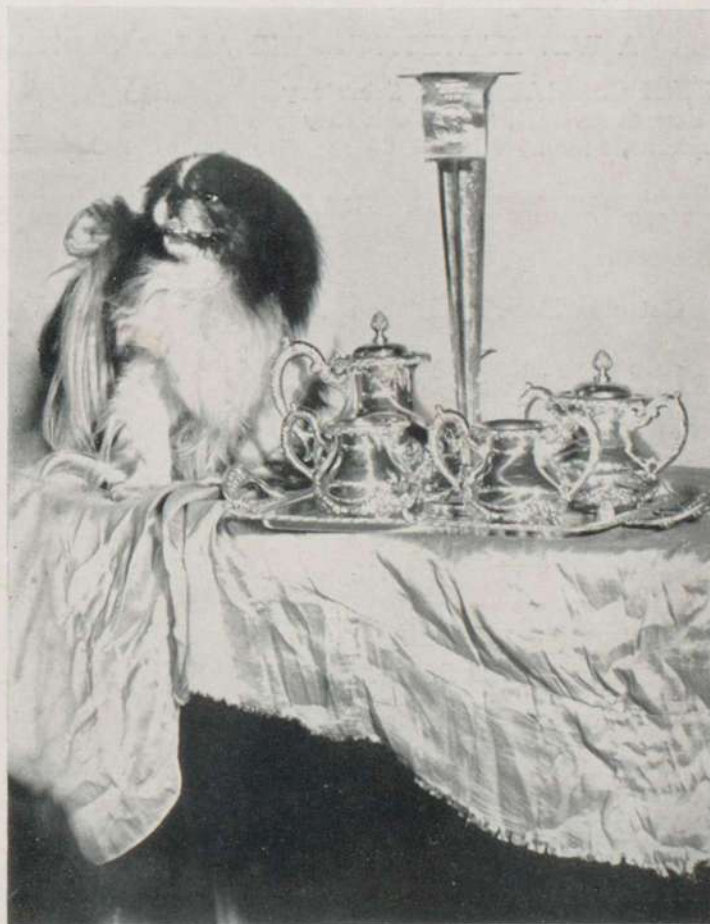
PEKINGESE KINGIE PONGE WAH