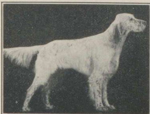
"MIKE OF BRIMORE" AT STUD

To the building of this establishment much thought and unlimited expense was devoted, including the patronage of the greatest English Setters of the day, viz.: Int. Ch. Pilot of Crombie of Happy Valley, Marvel of Crombie and others of similar calibre. The results of these breedings have proved most gratifying to us. Anyone wishing to own something outstanding in this breed may with confidence write us for particulars.