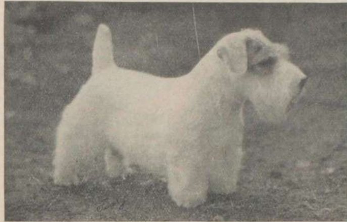
Amer. Champ. "Redlands Ranger of Hollybourne" (C.K.C. 944833)

While, at the moment, we have no stock for disposal we expect to have before very long.