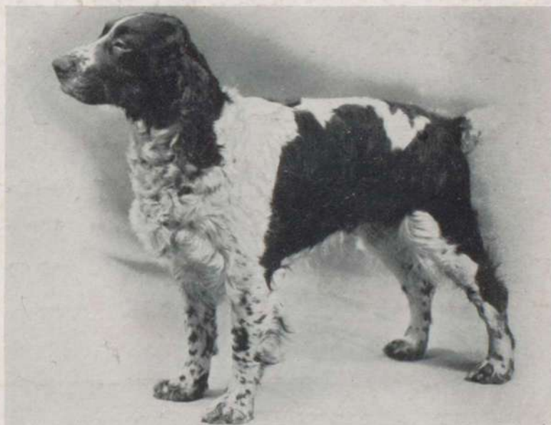
SPRINGER SPANIEL—INTERNATIONAL CHAMPION THORSDALE FIDELIS