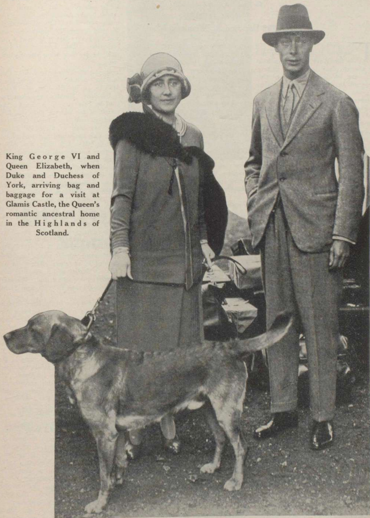
King George VI and Queen Elizabeth, when Duke and Duchess of York, arriving bag and baggage for a visit at Glamis Castle, the Queen's romantic ancestral home in the Highlands of Scotland.