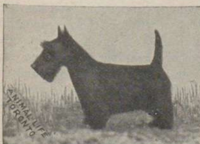
CHAMPION HALDON BARONESS