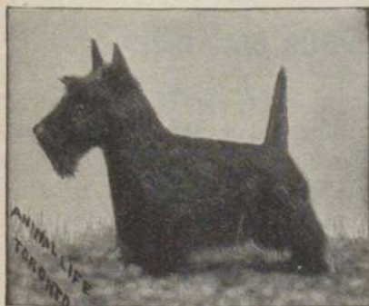
CHAMPION HALDON BANJO