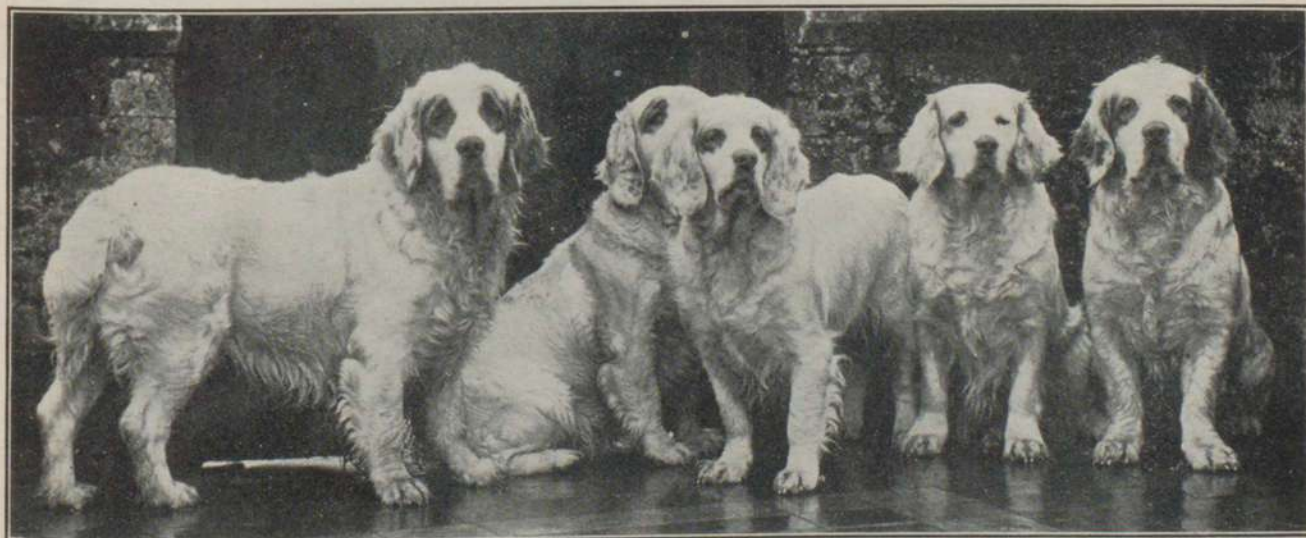
A group of the famous Clumber Spaniels from the Royal Kennels at Sandringham. Left to right, Sandringham Sparkle, Sandringham Scion, Sandringham Slip, Sandringham Swing and Sandringham Spice.

The Illustrated Kennel News of May 9th, 1902, reproduced a photograph of "Jack" as its frontispiece illustration, and gave the following particulars of the dog: "He came into the King's possession in November last, and now lives with His Majesty, travels with him and lies beside the King's chair all day as a faithful and inseparable favourite. His Majesty takes the most direct interest in all that appertains to