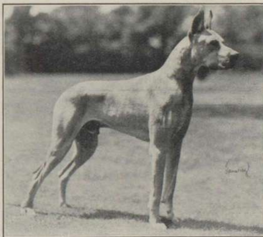
American and Canadian Champion MAX OF CAIRNDANIA, bred in our kennels, Max is considered one of the soundest Danes at stud. His fee is $50.

This outstanding Cairn Terrier topped the Terrier Group at Guelph and went Best of Breed at Mineolo, L.I.