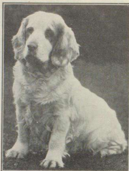
The Clumber Spaniel SANDRINGHAM SCURRY Shows the dignity of Royal dogdom.

The Duke of Windsor was at one time very keen on Welsh Terriers, but of late years was captivated by the charms of the little Cairn Terrier. H.R.H. the Duke of Kent is a very successful exhibitor of Bull Mastiffs. H.M. King George VI is keeping on the extensive team of Labrador Retrievers and Clumber Spaniels and the two little Princesses seem to be particularly fond of dogs. H.R.H. Prin-