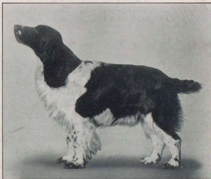
SPRINGER SPANIEL INTERNATIONAL CHAMPION ROYAL FLUSH OF AVALON