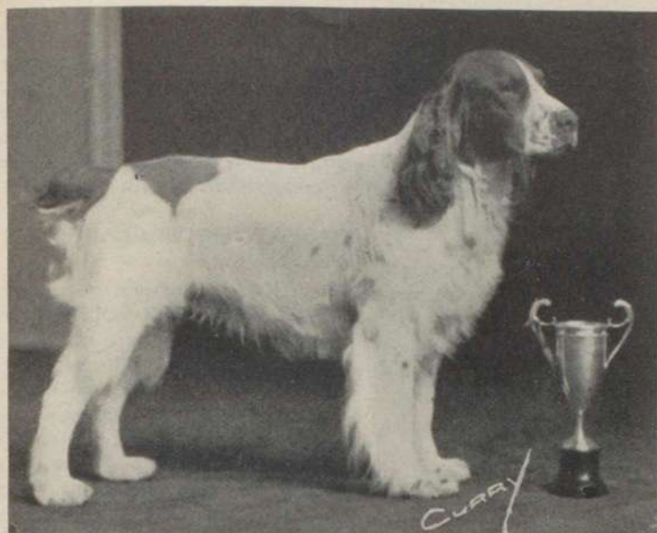
WHITELIGHT (C.K.C. 121828)