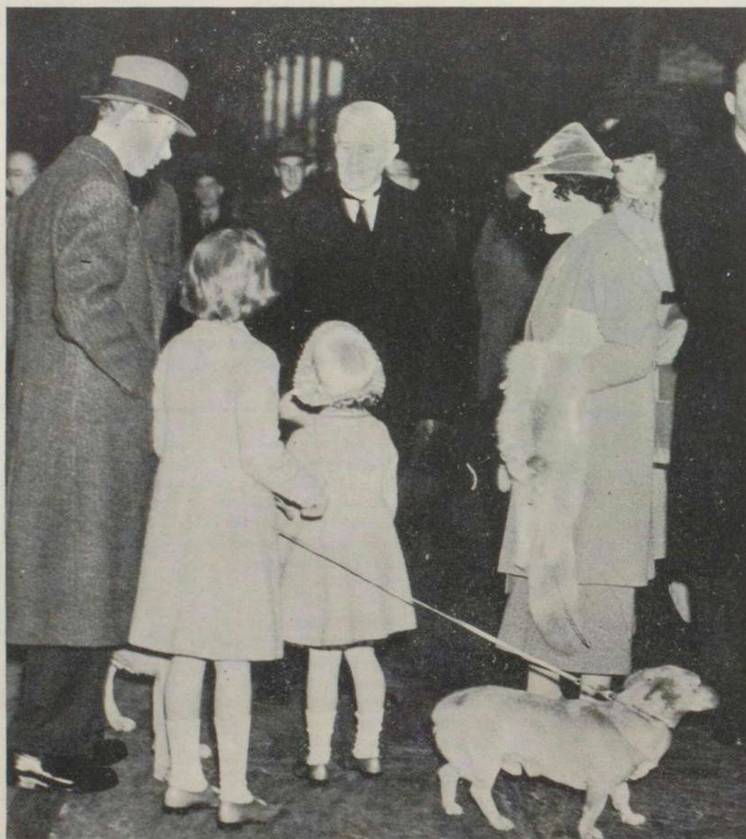
The King and Queen and little princesses with one of their pet dogs.

lin, Isle of Wight. At the time of our visit H.M. Queen Victoria was in residence at Osborne Castle and during one of our walks we met Her Majesty's faithful gillie, John Brown, exercising some of the collies to which Queen Victoria was so attached. I cannot recall how the collies would compare with our present day collies, but one dog, a big upstanding, heavy coated black and tan, has always re-