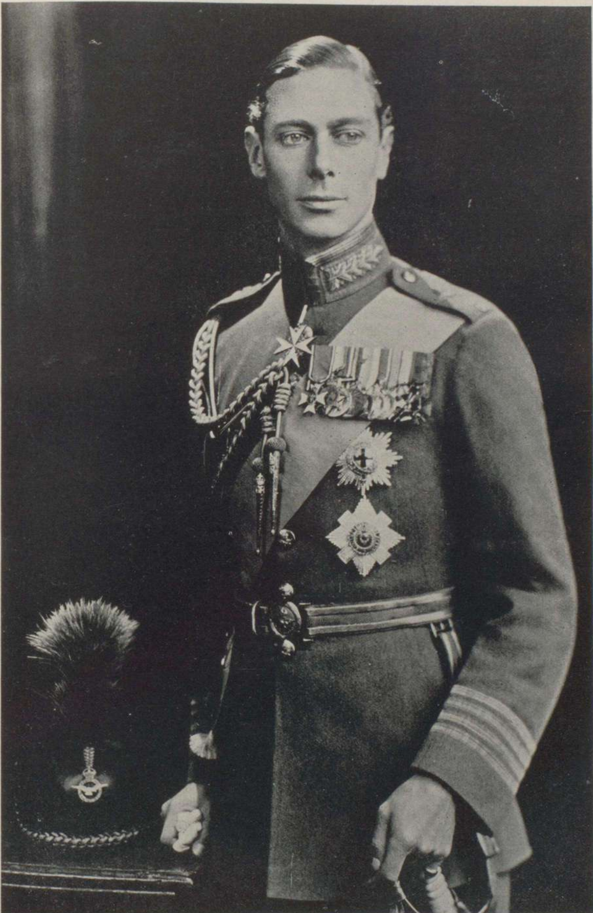
His Most Excellent Majesty George the Sixth, by the Grace of God of Great Britain, Ireland and the British Dominions beyond the Seas KING, Defender of the Faith, Emperor of India.