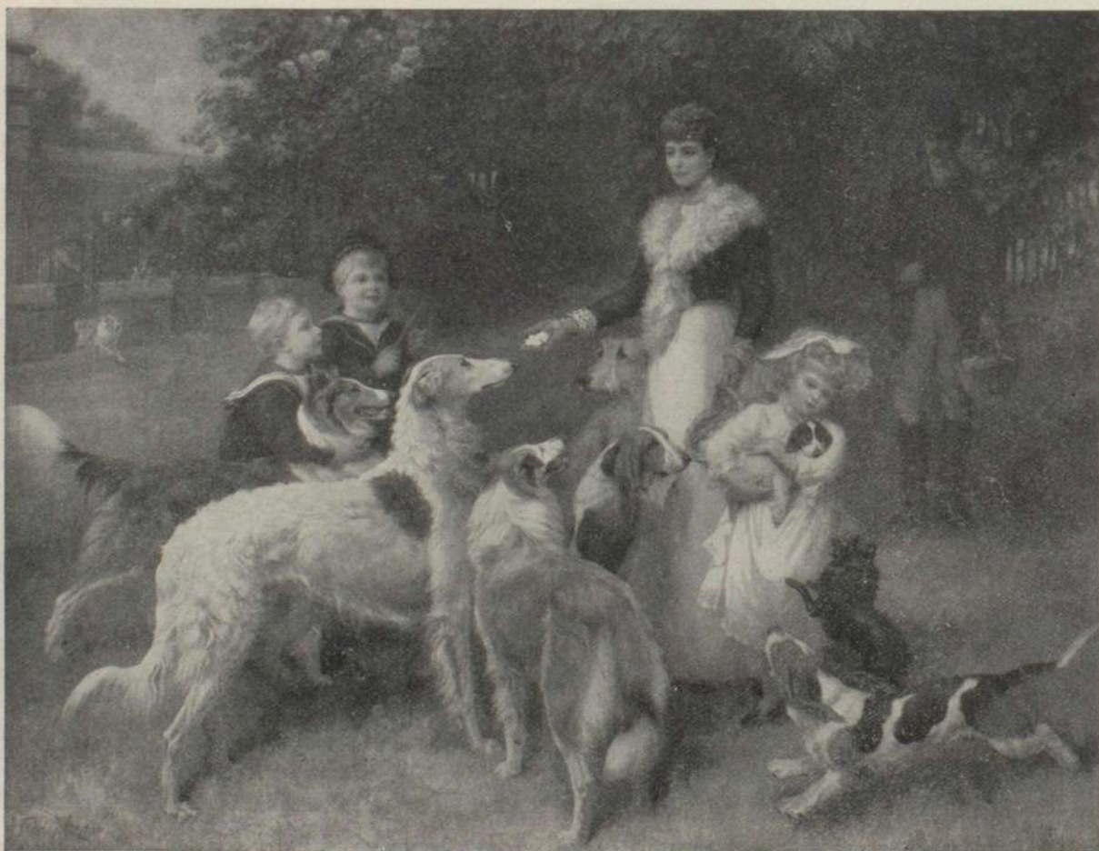
The Dogs of the Royal Family.