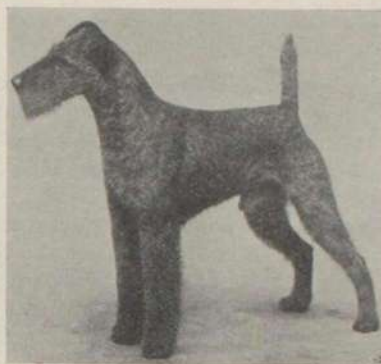
Champion Sandy's Choice

Champion Newtownards Irish Kid. Champion Newtownards Palmer's Barney.