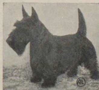
CH. HALDON TROUBADOUR