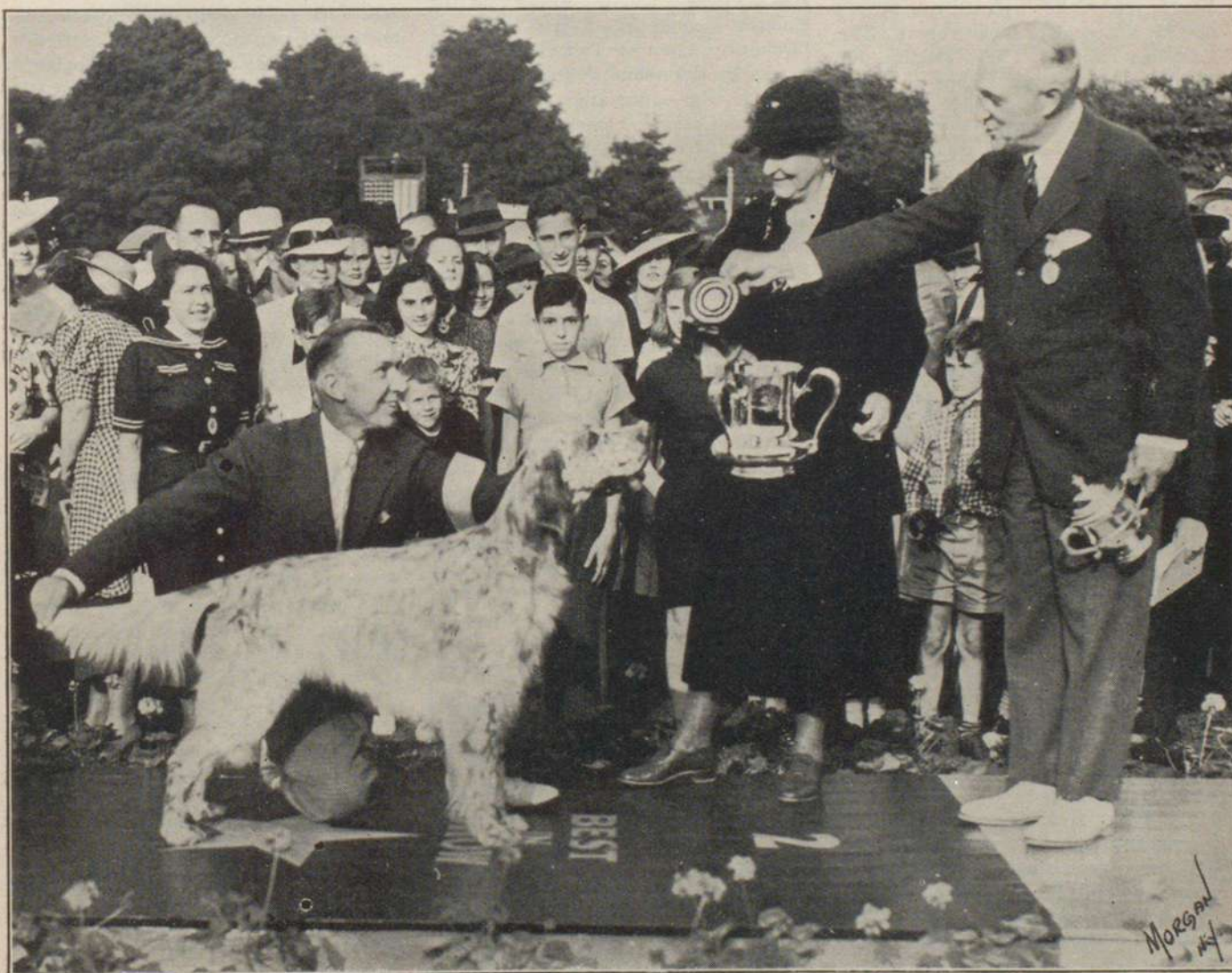
MORRIS AND ESSEX SHOW, 1937—AWARDING BEST DOG IN SHOW