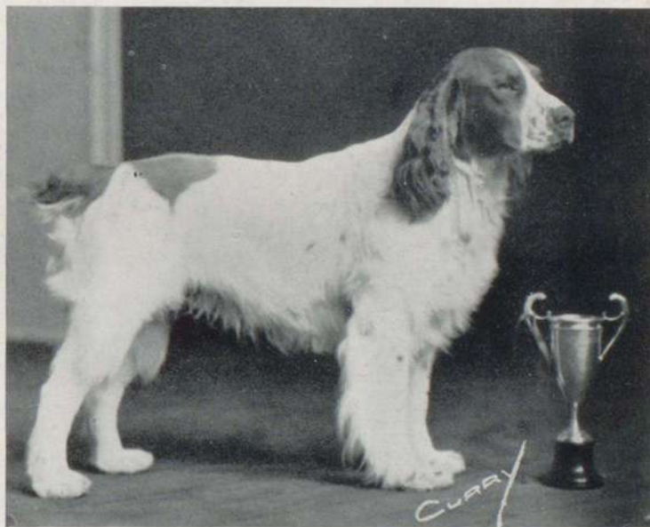
SPRINGER SPANIEL CHAMPION WHITELIGHT (C.K.C. 121838)