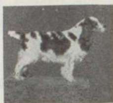
Ch. "Kindon Freckles"

An outstanding red and white cocker. Ch. "Kindon Freckles" has always been best of breed; winner of the sporting group several times. If you are looking for a good cocker this is it—at a reasonable price. Write: