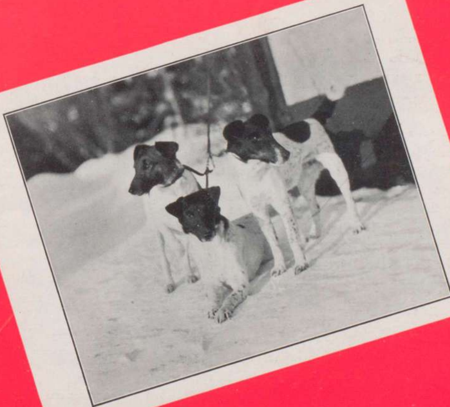
A CHAMPION TRIO (Left), Ch. "Lapping Wavelet" (Imp.); (Center), Ch. "Breakeyton Huntsman"; (Right), Ch. "Breakeyton Freckles".

Noted Canadian Judge To Select Best in Show at Morris & Essex