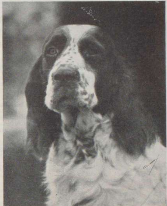
TREVILLIS FEARLESS A Proven Sire of Quality Puppies