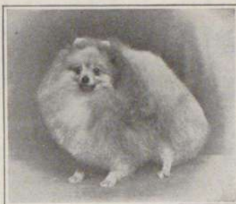
Ch. "Minegold Duguid (imp.)"

The number of breeds in the Toy Group may be small, and the breeds in that group are, on the whole, smaller than those in any other group, but despite these facts representatives of this group usually can be expected to appear in the limelight much more frequently than their diminutive size would probably indicate.