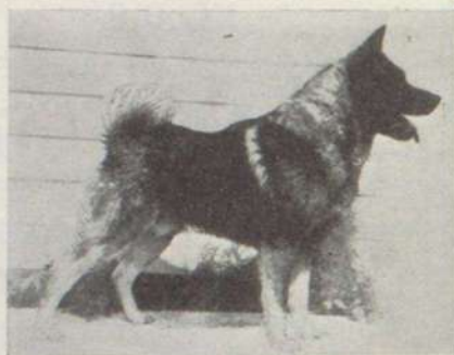
FLING OF THE HOLM (Ch. Mirkel of the Hollow ex. Ch. Ula)

A chance to secure a good puppy of this remarkable breed for show or companion. I have a litter of well developed, hardy puppies, 3 mo. old, both sexes, imported in dam from England. Sired by a well known dog of the Fourwinds strain. Dam from the famous "of the Hollow" kennels. Reasonably priced.