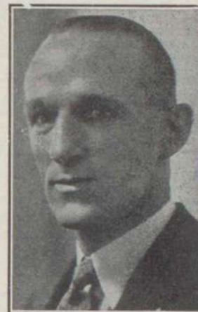
I HANDLE TO WIN