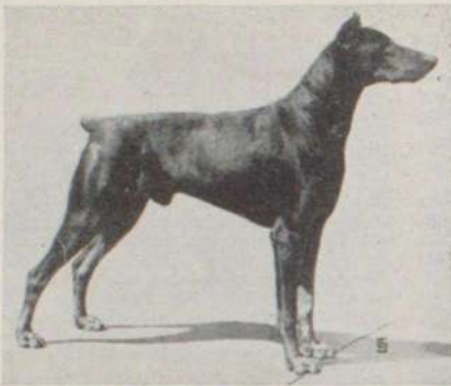
Troll v.d. Engelsburg