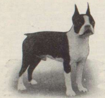
FLASH AGAIN SONNY