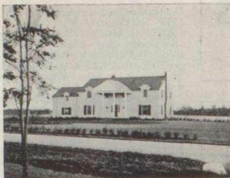
HOME OF SAINTS REST KENNELS

were the ONLY Boston entries to place in the ribbons at this Morris & Essex fixture; and continued their enviable record of 1st place in over 90% of all classes shown at shows in both Canada and the U.S.