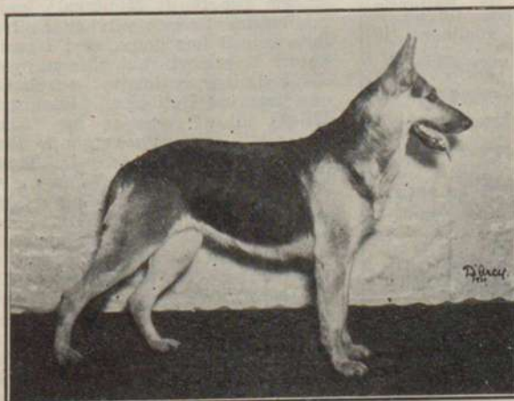
Ch. Flamette von Drachenfels