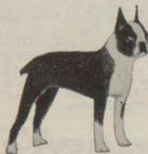
Golden Jubilee's See-Me-Go