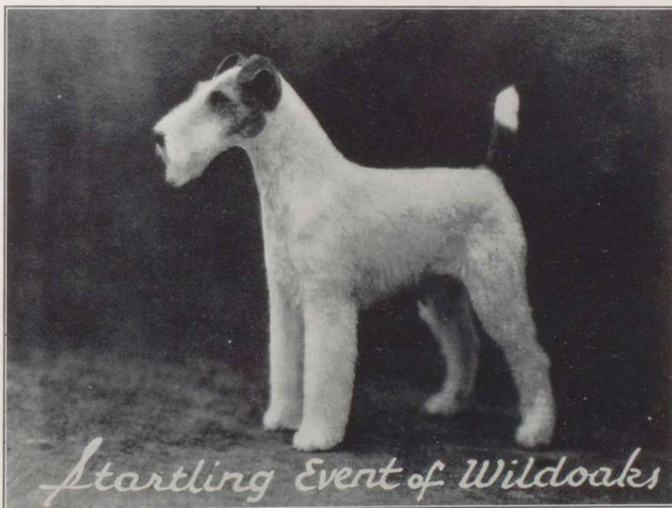
THE WIRE FOX TERRIER Ch. Startling Event of Wildoaks Property of the Malabar Kennels Point Fortune, Que.

For list of Forthcoming Shows see Page Three