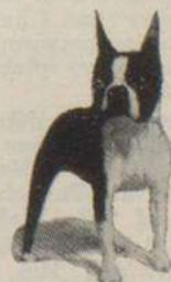
Flash Again's Regards