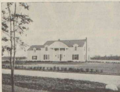
HOME OF SAINTS REST KENNELS

high quality of out stock, on our scientific breeding program, and on our HONEST endeavours to better the breed rather than our bank account.