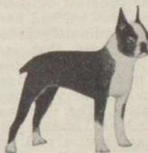
Ch. Golden Jubilee's See-Me-Go

* The four dogs marked with an asterisk completed their Championship between November last year and the Canadian National Exhibition this year and Jubilee Kennels Reg'd are justly proud of the record built up in such a short period.