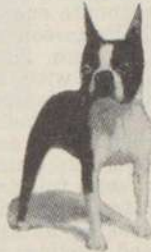
Ch. Flash Again's Regards

Made at all the Shows between Montreal and Win- dsor and under all the judges that came along.