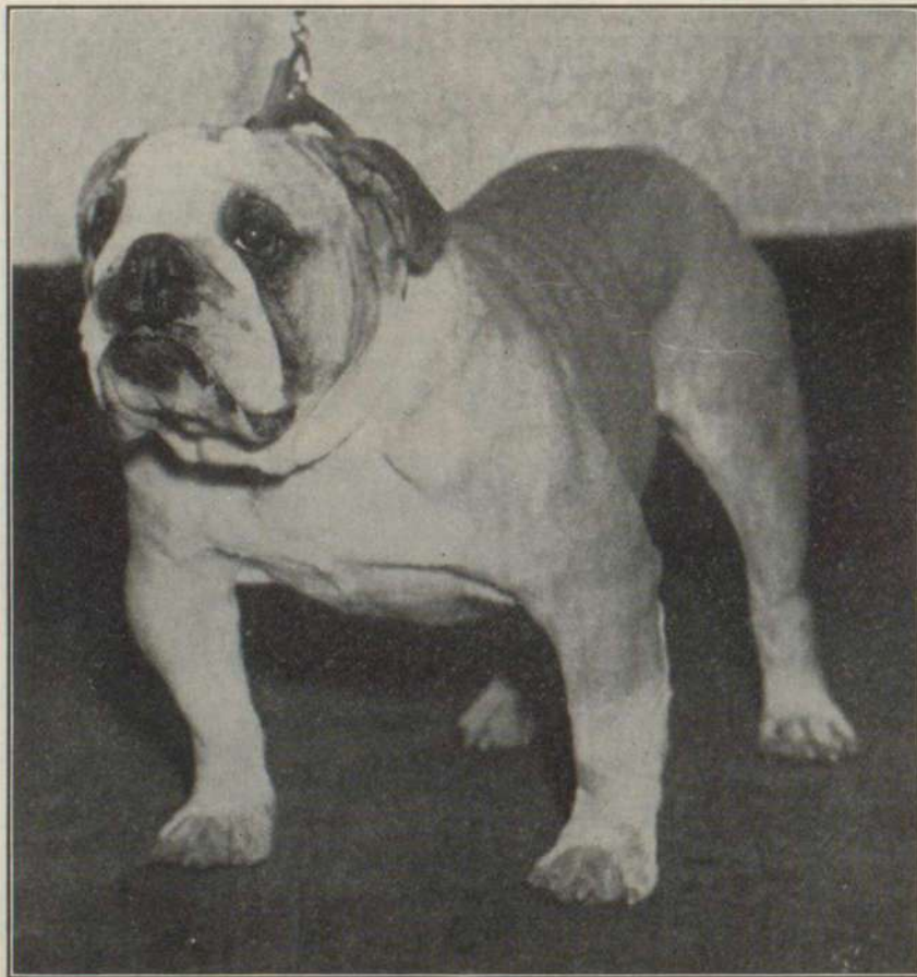
English Champion "Basford Golden Nymph" Best Bulldog at Westminster (48 entered, 40 in competition) was favoured by many for Best Dog In Show.

Northcote Pym's, Vancouver, Dolly Dollars.