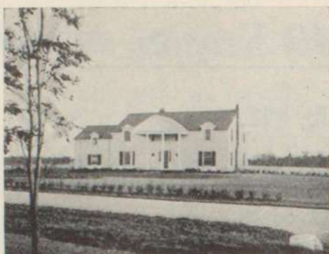
THE HOME OF SAINTS REST KENNELS