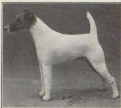
CHAMPION ARMAINE BUCANEER