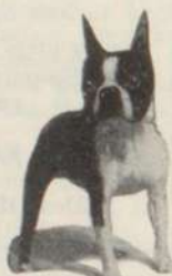
Ch. Flash Again Regards

This smart Boston Terrier gives promise of becoming one of Canada's Outstanding Sires. His comely daughter, Jubilee's Lit-a-Bit-of-Joy was Best Puppy at the Boston Terrier Club of Toronto Specialty Show. She has been Reserve Winners at Toronto, and at London (twice).