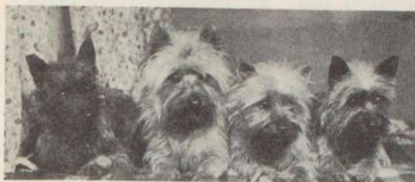
Champion Bunty Jr.