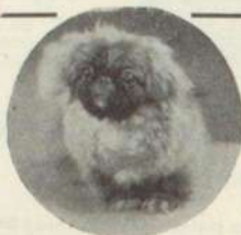
"Marina of Willow"