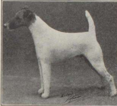
CHAMPION ARMAÏNE BUCANEER