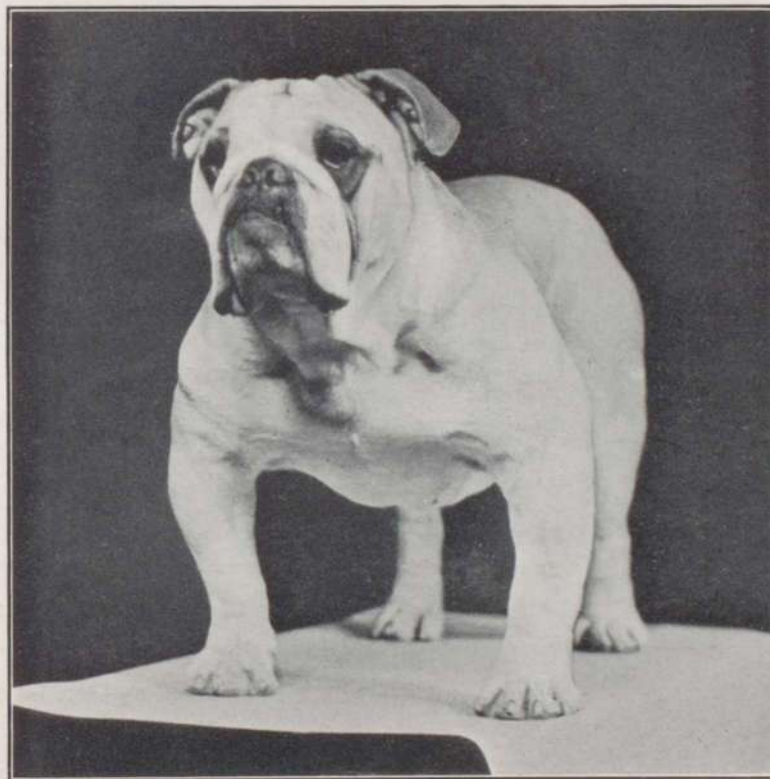
BASFORD GOLDEN NYMPH (Imported)