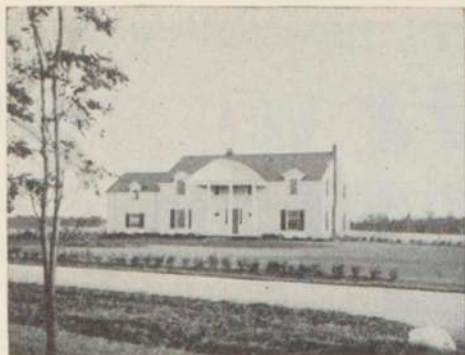
THE HOME OF SAINTS REST KENNELS