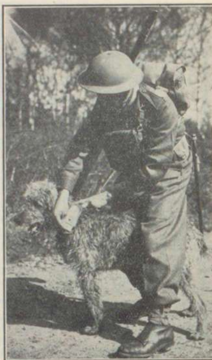
THE MESSAGE BEARER

It is clearly understood that there is much more for breeders to strive for than weight and height in their breeding and show stock, nevertheless, weight and height are sound essentials and must be complied with as foundations upon which to build up sound judgment. It is quite true that the Irish Terrier has made wonderful progress in recent years. It is equally true that this very day he has more loyal supporters than ever before, and further, it is quite true that in Canada we have many fine specimens around, including Champions, and at least,