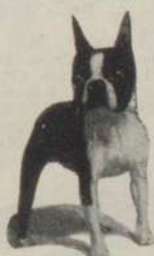
Ch. Flash Again Regards