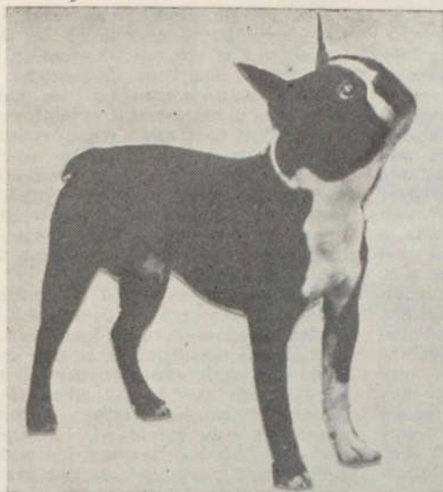
FLASH AGAIN'S YANKEE BOY C.K.C. 158832 A.C.K. A353083