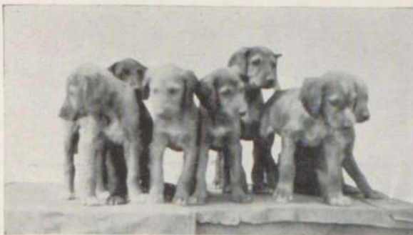
7 Afghan Pups Raised on Gaines Formula, 107-A

WEAR FOOD CO., 2114 Queen E., Toronto, Ont.