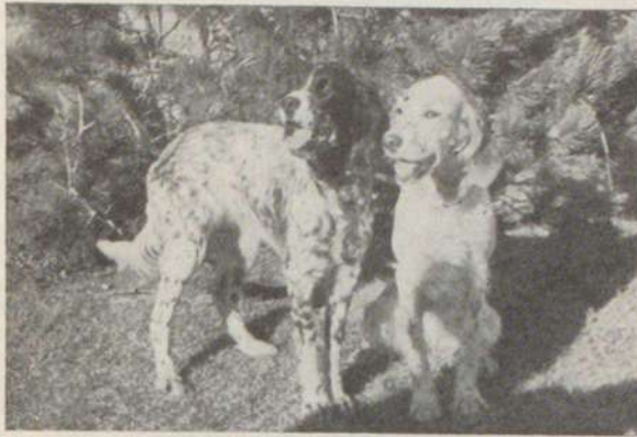
BITTNEY'S ROYAL LADY ROYAL LADY OF ORANGE