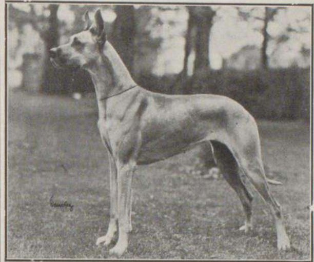
(Can. Ch. Venus Hexangold, owned by Cairndania Kennels, Brockville, Ont.)