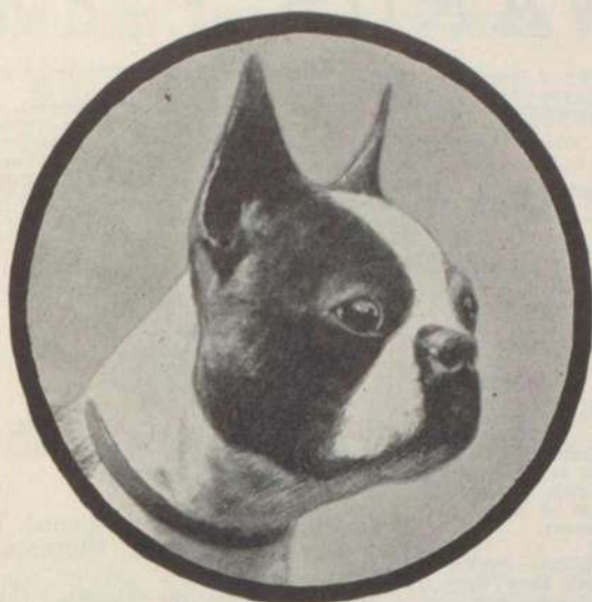
CHAMPION PADDY'S TONEYONE