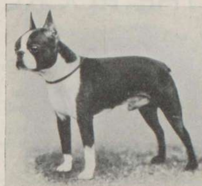
INT. CH. SAINTS REST DOUBLE ACE

An outstanding son of Int. Ch. "Elyria Easter Parade", out of the full litter sister of "Royal Kid", and ably carrying-on the heritage of both bloodlines.