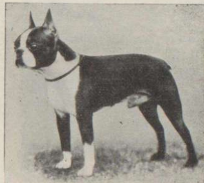
Int. Ch. 'Saints Rest Double Ace

Besides being the sire of a lovely U.S. Champion female, and several other fast ones, he is the sire of the