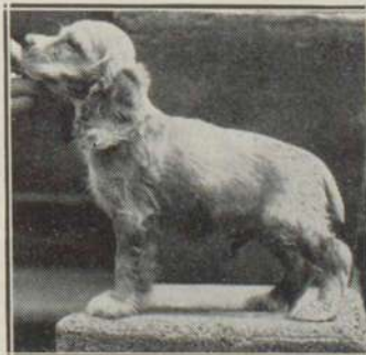
Six weeks old puppy by RICHMARYS SON OF SOLOMON