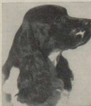
CH. DAN'S JODY