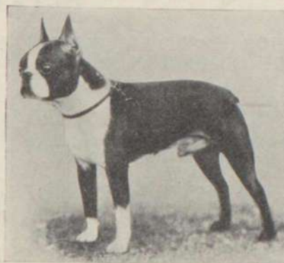
The record-breaking Int. Ch. Saints Rest Double Ace

The results of the 1941 Spring Show Circuit, at London, Chatham, Wind- sor, Hamilton, and Mon- treal, place Saints Rest Bloodlines well on top.