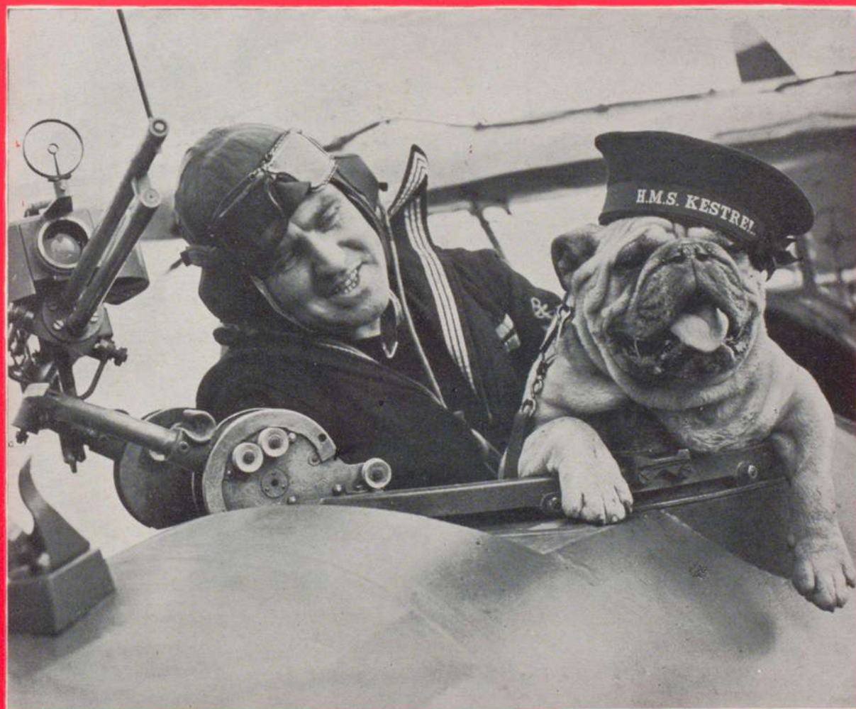
This BULLDOG, mascot at a Fleet Air Arm training base, typifies the spirit of the navy to-day.

FOR LIST OF FORTHCOMING SHOWS SEE PAGE THREE