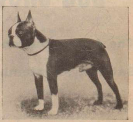
The Record-Breaking Int. Ch. Saints Rest Double Ace

Therefore it is not unusual that breedings or bookings to EASTER PARADE and to SAINTS REST DOUBLE ACE within the past three months, have included: