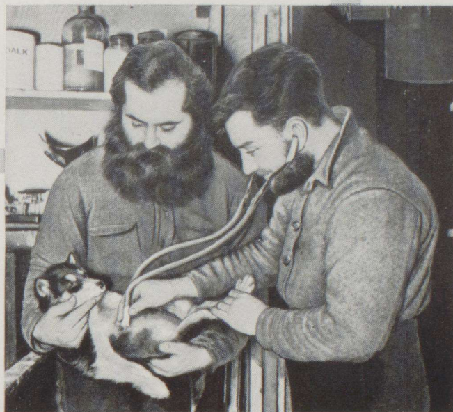
The rugged Husky pup shown above was born near the South Pole. He and other U. S. Antarctic Expedition dogs are in the U. S. Army now. Like the Expedition, the Army feeds Gaines, too!

● See for yourself what Gaines can do for you by feeding it in your own kennels for 30 days— without risking a single cent . Make this famous HALF KENNEL TEST: Feed