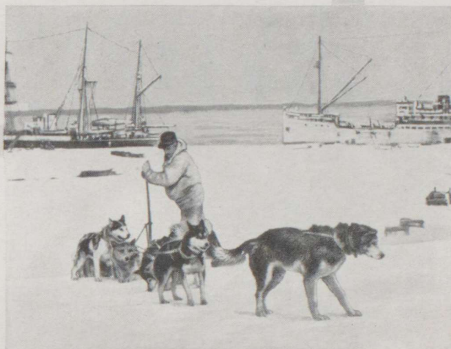
For overland transportation of vital supplies the Expedition depended on dog teams like this.

Best of all, the benefits that Gaines offers dogs are truly economical! Indeed, Gaines often cuts feeding costs—even when it replaces foods that cost less to buy.