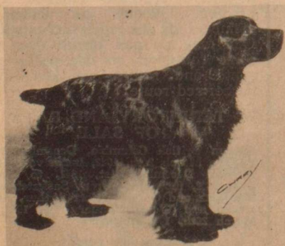
Ch. Kincaid's Own Surprise (Black) At Stud