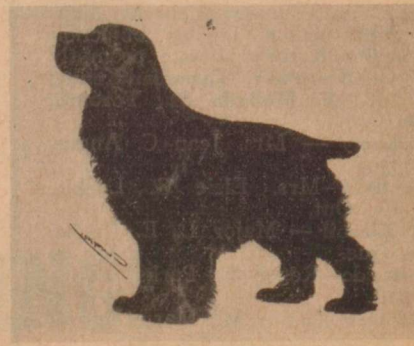
Ch. Noni's Foto Nite of Kincaid (Black) At Stud