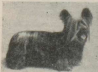
"Talisker Skyes are winning Skyes"