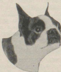
Ch. Little Sir Echo