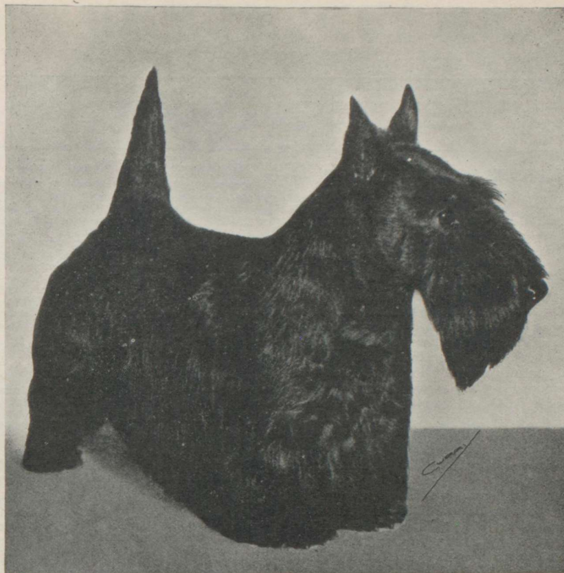
CH. DESRIL ROCK

Answer: It often happens that the front teats will show an acid reaction as the puppies do not use them as frequently as the rear ones. When these glands do not function normally, the milk is apt to undergo a change which