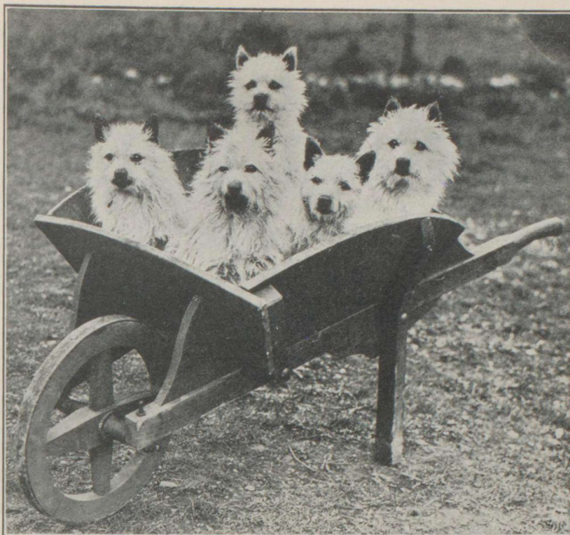
Five Westies ready to go places if someone will oblige.