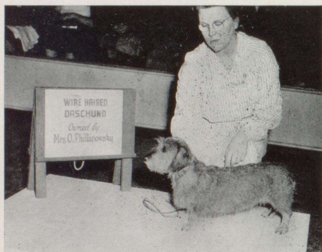
"Freida" in Champion Parade, Canada Pacific Exhibition, 1941.

Reservations Now Being Made for Litter From CH. FREIDA OF KILKEE — SIRED BY CH. LOCAN OF TYNEWYDD Ready for dispersal late September or October