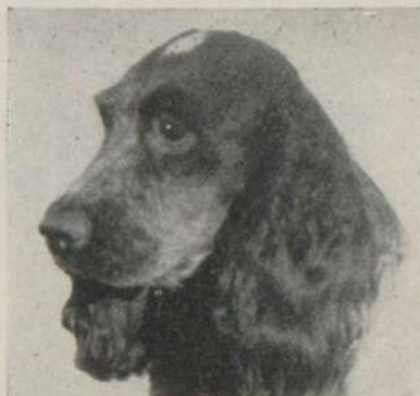
CH. SEAFIELD CINDERELLA

Ch. Fidalas Gilded Lady (Red) Ch. Seafeld Cinderella (Blue Roan) Ch. Sweetheart of Seafeld (Red) Seafeld Dream Girl (Orange and White) Black Onyx of Seafeld (Black) Seafeld Black Gem (Black) Countess of Seafeld (Red) Lady Beth of Seafeld (White and Black) Ch. Lucky Streak of Isla (Black and White) Ch. Marquis of Seafeld (Blue Roan) Wayside Cavalier (Black) 8 pts.