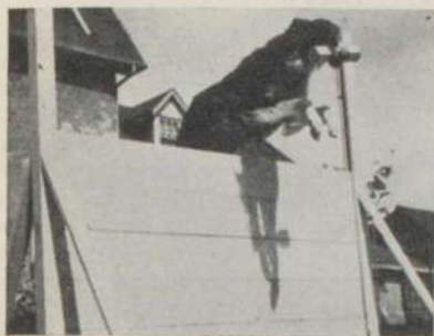
AM. CH. CZAR III OF GLENWILD