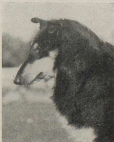
Ch. Elmhill Edina of Quarrybrae