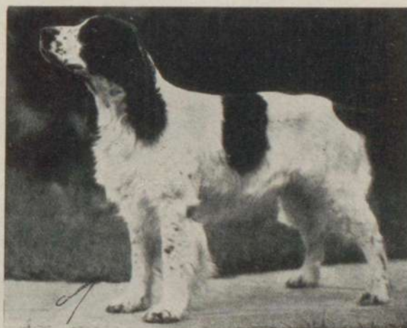
INT. CH. WHITELIGHT

The Canaline Kennels' first acquisition in Springer Spaniels and the founder of this famous strain, is continuing to stamp his progeny with all the characteristics so essential to the breed.