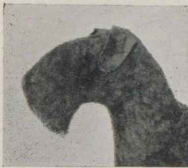
Ch. Kenmare Dark Review, Best in Show and dam of the latest champion, Ken Robin Killala.