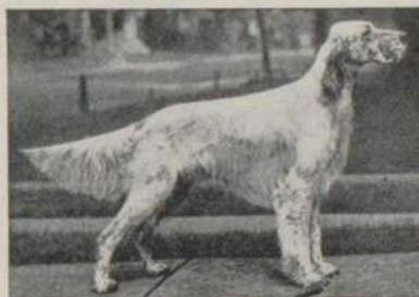
CH. RUMMEY OF FAIR GLEN,