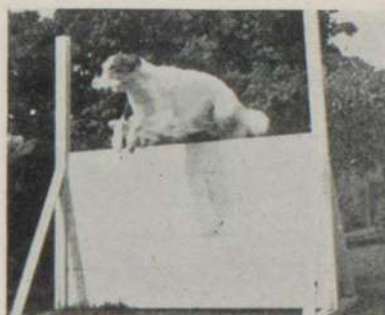
AM. CH. SERGEI OF GLENWILD

4. In retrieving dumbbell on the flat the dog should not move forward to retrieve nor deliver to hand on return until ordered by the handler. The retrieve should be executed at a fast trot