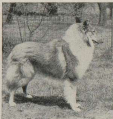
"Bellhaven Model's Commander"