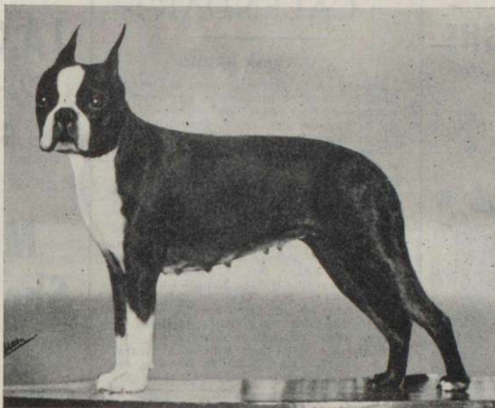
CH. SAINTS REST HIGHLAND QUEEN

Another champion has been added to the list of those produced from Saints Rest stock.