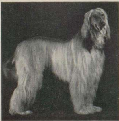
INT. CH. KURRUM-EL-MYIA