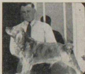
GUNNER OF SPRINGBROOK C.K.C. 176653