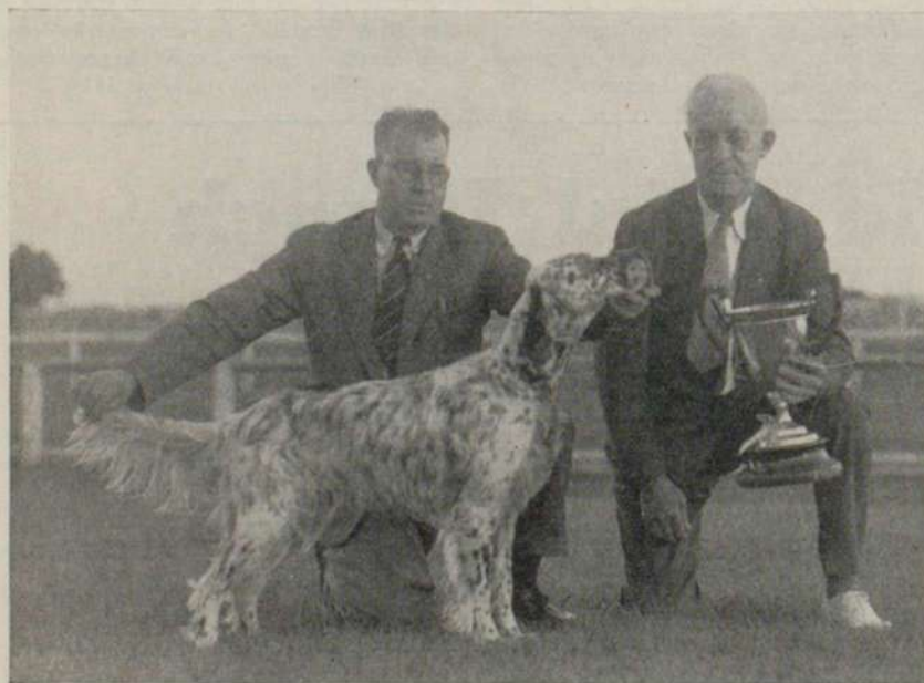
HIGH CLIFF KING PIN,

In closing, I would like to say that there are several other good males in Ontario, but, as the owners decline to bring them out, I find it impossible to mention them as to value as stud dogs, or to recommend their lines as stock. It is my hope that these few notes will be of some value in the future to Novice and Breeder alike, in building up their stock. I find that the average female is smaller and the construction generally too fine, thus a good large sire is required to build up our English of today.