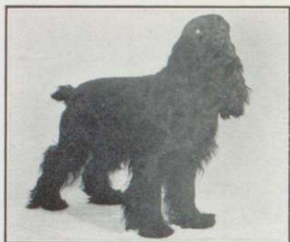
Ch. Kappa Son of Surprise