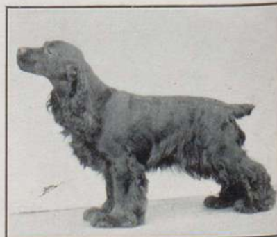
Ch. Cora Lee of Kincaid