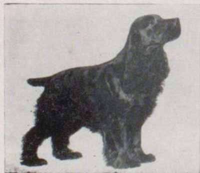
Ch. Photo Nite of Kincaid