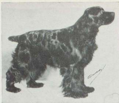
Ch. Kincaid's Own Surprise