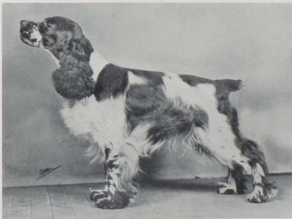
Champion Merryman of Warwick Black and White Cocker Spaniel