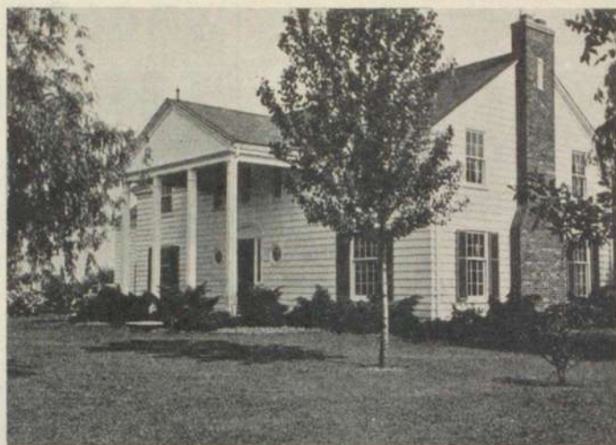
The country home of Saints Rest Bostons.

Are you interested in how many Champions any given kennel has OWNED, or do you base your evaluation on how many Champions the actual breeding stock of any kennel has PRODUCED — and is still producing?