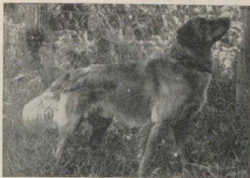
Rufus of Kinkyle