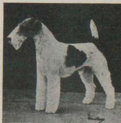
Ch. Vivadora Easter Parade

We just mated our Int. Ch. Crackley Striking bitch to him and Ch. Vivadora Lady of Fairmounts is heavy in whelp to Ch. Westdale Streamline.