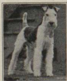
Ch. Westdale Streamline