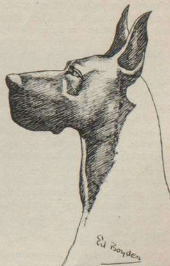
CHAMPION SEMMER OF CAIRNDANIA GREAT DANE

Those were some of the men and some of the incidents in those six days.