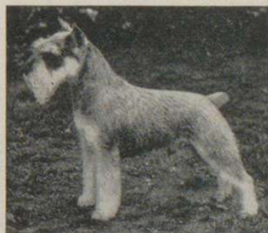
Ch. Cockeral of Sharvogues