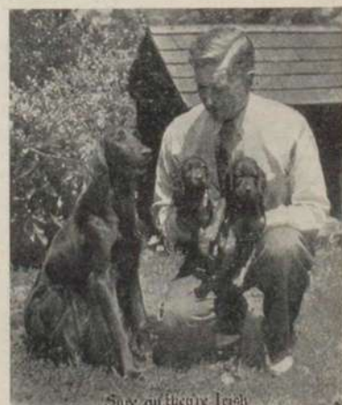
Save all their teeth