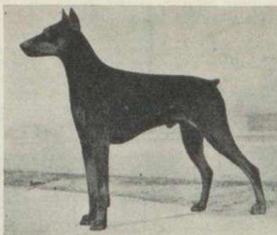
American Champion WESTPHALIA'S RAMESES C.D., C.D.X.