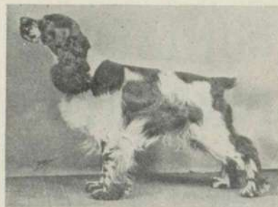
Ch. Merryman of Warwick

COCKER SPANIELS CHAMPION BRED STOCK For SHOW or BREEDING