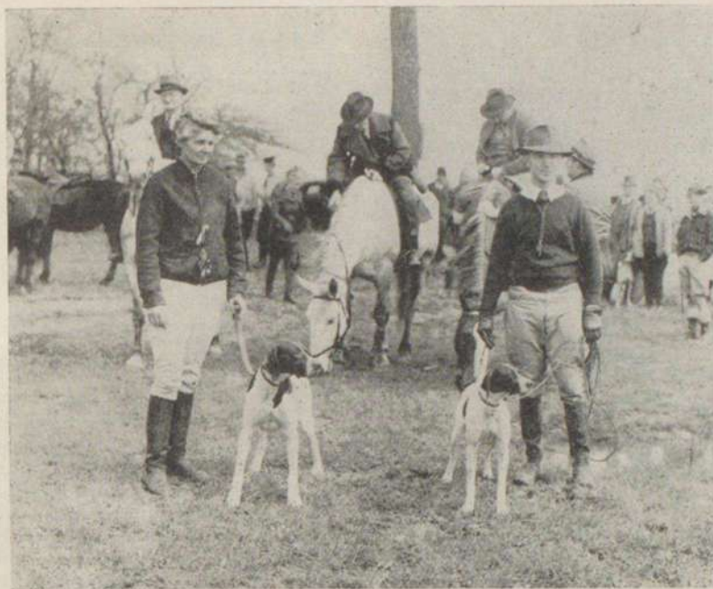
JUDGES FOLLOWED DOGS MOUNTED ON HORSEBACK AT SPRING TRIALS OF ONTARIO BIRD DOG ASSOCIATION THIS YEAR