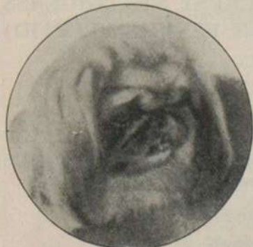
Stud Dogs for Services. Fees reasonable.