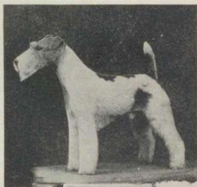
INT. CH. WYNWYRE'S SADDLE