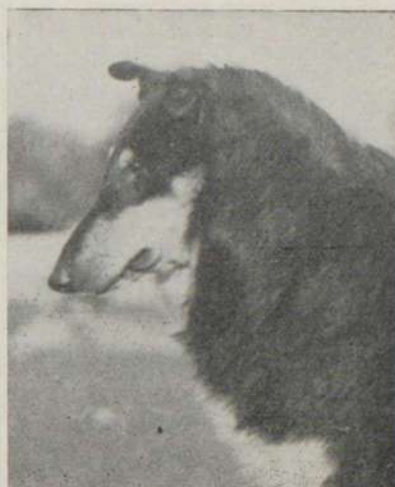
Ch. Elmhill Edina of Quarrybrae