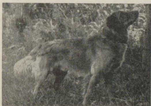
Rufus of Kinkyle