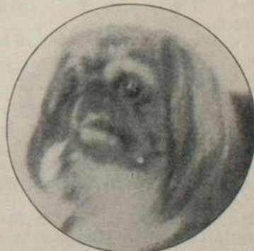
Dogs boarded, handled and conditioned for all shows.