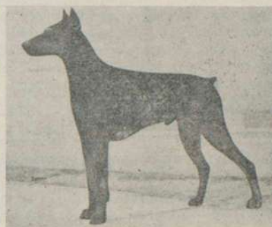
AM. CHAMPION WESTPHALIA'S RAMESES, C.D.X.