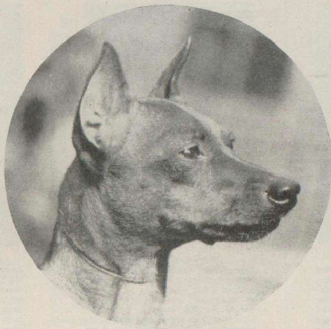
INTERNATIONAL CHAMPION TRAIL BLAZER OF GEDDESBURG

WHOSE WINS FOR 1944 include BEST IN THE TOY GROUP at LONDON CANINE ASSOCIATION, GUELPH KENNEL CLUB, PROGRESSIVE KENNEL CLUB, PEEL COUNTY KENNEL CLUB, LAKEHEAD KENNEL CLUB. She placed reserve Best in Show at Lakehead.