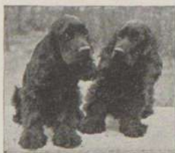
Rockcroft Good Cockers

7. When the judge gives a line to a handler and a dog to follow, this must be followed and the dog not allowed to interfere with