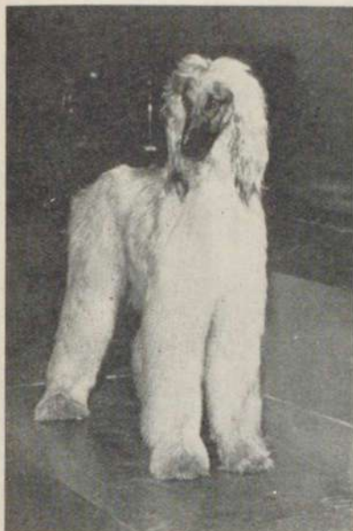
Int. Ch. Rudiki of Prides Hill