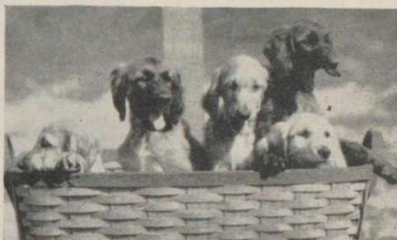
Five from Five Mile, Eight Weeks Old.