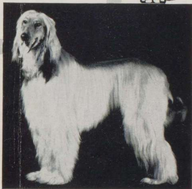
Int. Ch. Kurram El Myia, bred and owned by El Myia Afghan Kennels, West Hill, Ontario, Canada. Fed Gaines Food since weaning!

Gaines Food is made in two forms—Meal, which you mix with warm water—and Krunchon, which is the same product as Meal but pressed into pellet shape which you feed to the dogs just as it comes in the bag. Both available in 2-lb., 5-lb., and 25-lb. bags.