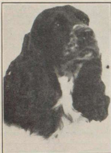
For Sale CH. CEE HAZE BOMBARDIER Pictured above

Our kennel has been moved to RIVERFRONT ROAD, No. 18, at Bus Stop 70½ near Amherstburg, Ont.