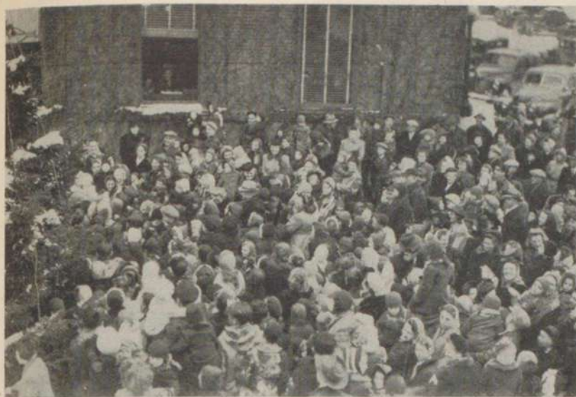
Santa in Bridgewater.