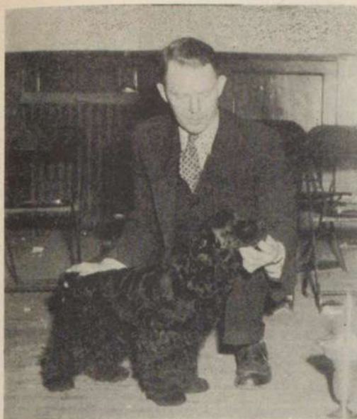
B.I.S. "COMMANDO", December 7th, 1945