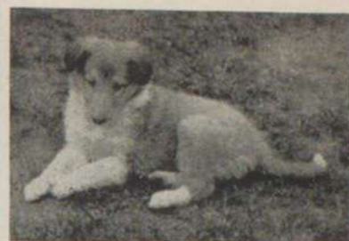
A Quarrybrae at 6 Weeks